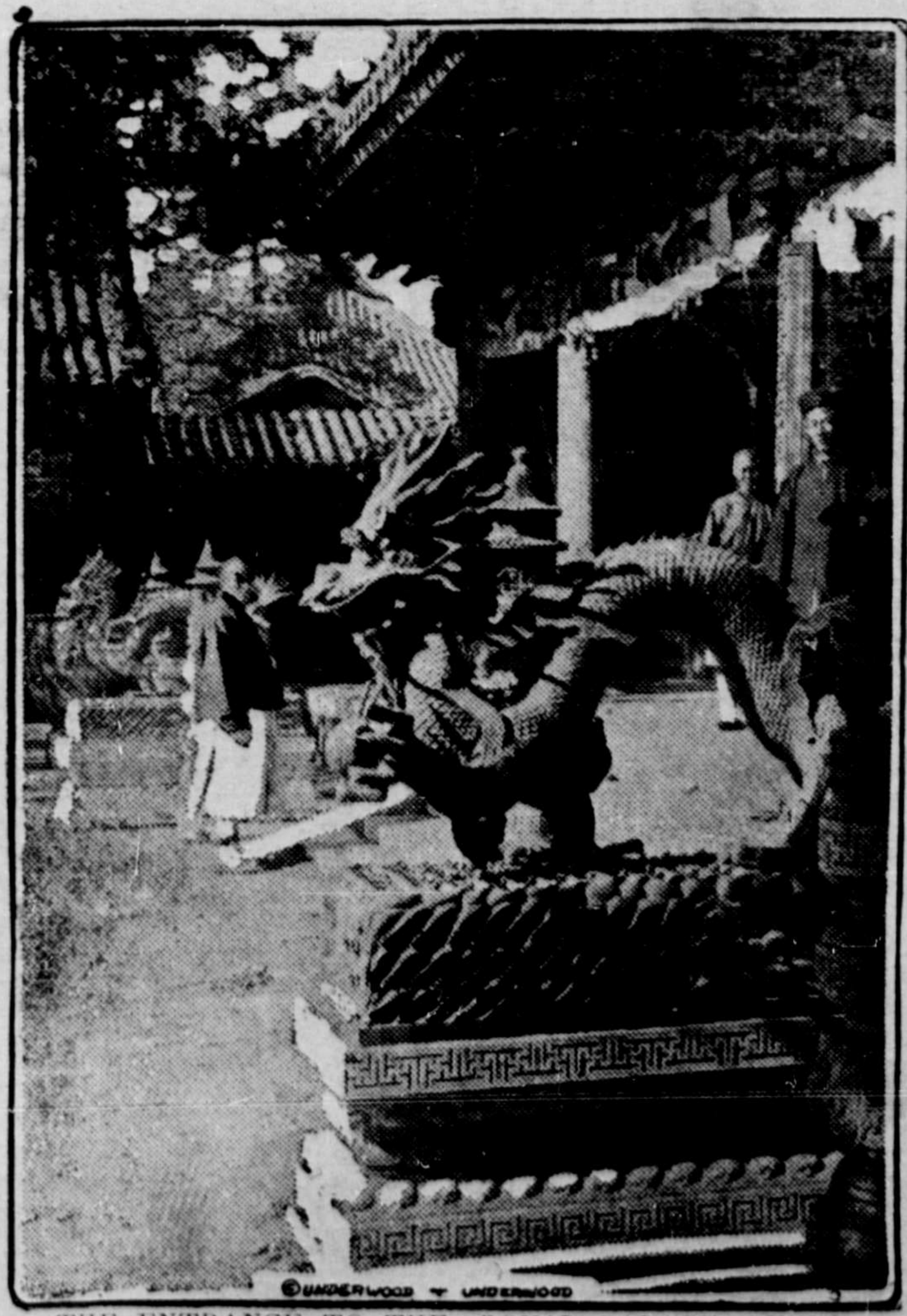
THE ENTRANCE TO THE ROYAL PALACE, PEKIN.

BUTCHERED BY RUSSIANS Report That Cossacks Have Killed a Thousand Persians. (Canadian Press Despatch.) London, Dec. 26.—Great anxiety is felt here following reports that more than a thousand Persians have been slaughtered in a clash with Russian troops at Tabriz. It is stated that the Cossacks butchered peaceful citizens in the streets, and could not be controlled by their officers.