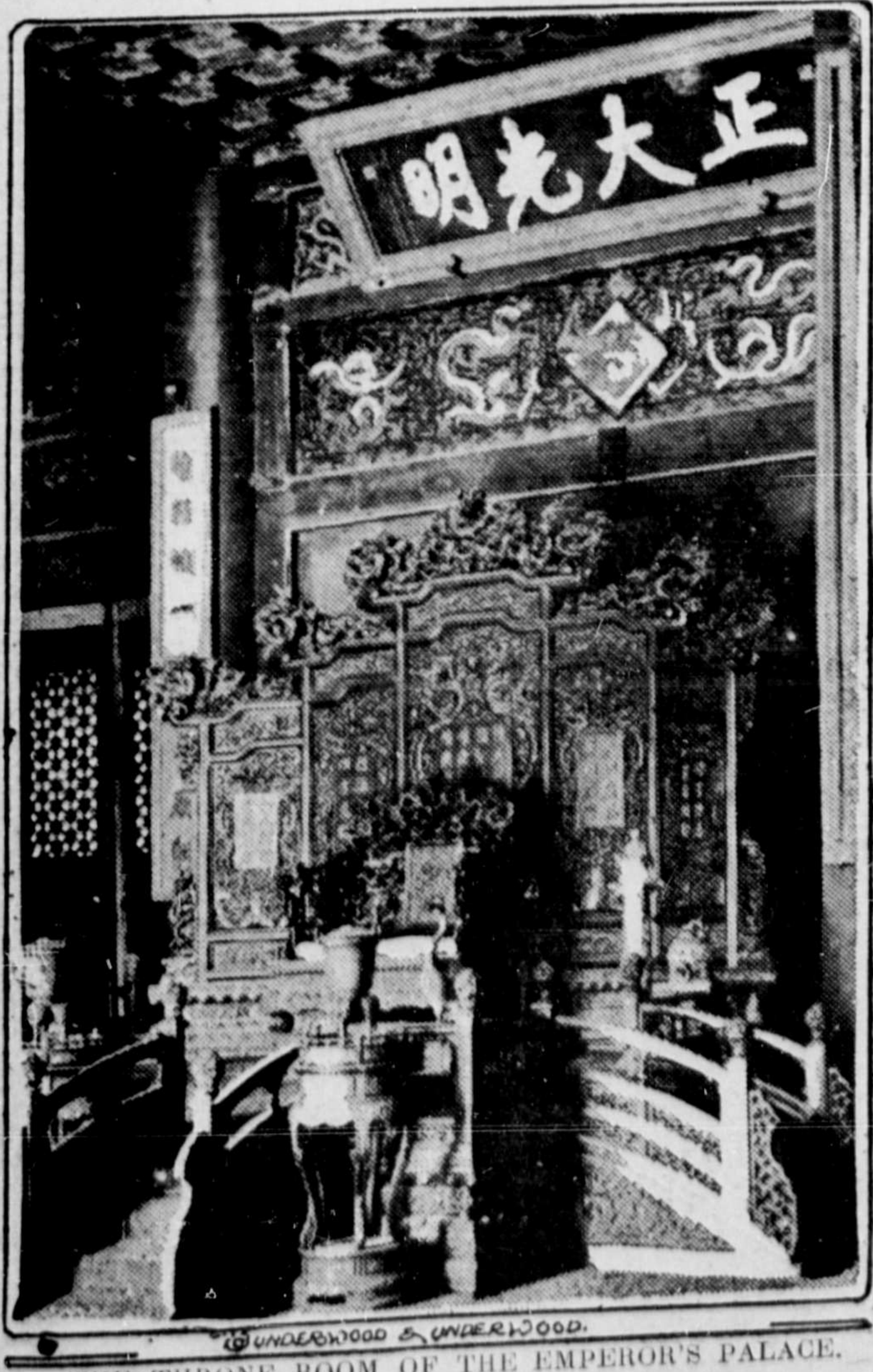
THE THRONE ROOM OF THE EMPEROR'S PALACE.

The little boy-emperor of China lives in a beautiful palace in the Forbidden City, in the heart of Peking. He is only five years old, but surrounded by all the pomp and mockery that is associated with royal courts. He is only nominally the ruler. In effect, he is ruled by the Manchu princes who are at the court. It is a pathetic spectacle to see this little child on his tottering throne sending out each day messages to his people granting new concessions to liberty. These messages are, of course, concocted by the Manchu princes, and are signed by the infant ruler with his own hand—a pitiful attempt to arouse sympathy. Some of the messages become ludicrous in their effort to catch the popular sentiment when the little Emperor assures his people that though he has been misled by his advisers in the past he intends to assert his own judgment in the future. The spectacle of this 5-year-old Emperor, debared from the happiness and freedom that the child of the poorest peasant enjoys, is the most pathetic spectacle in the present Chinese upheaval. Fresh Eastern Oysters in shell at Shruballs Market, Third avenue. 2t