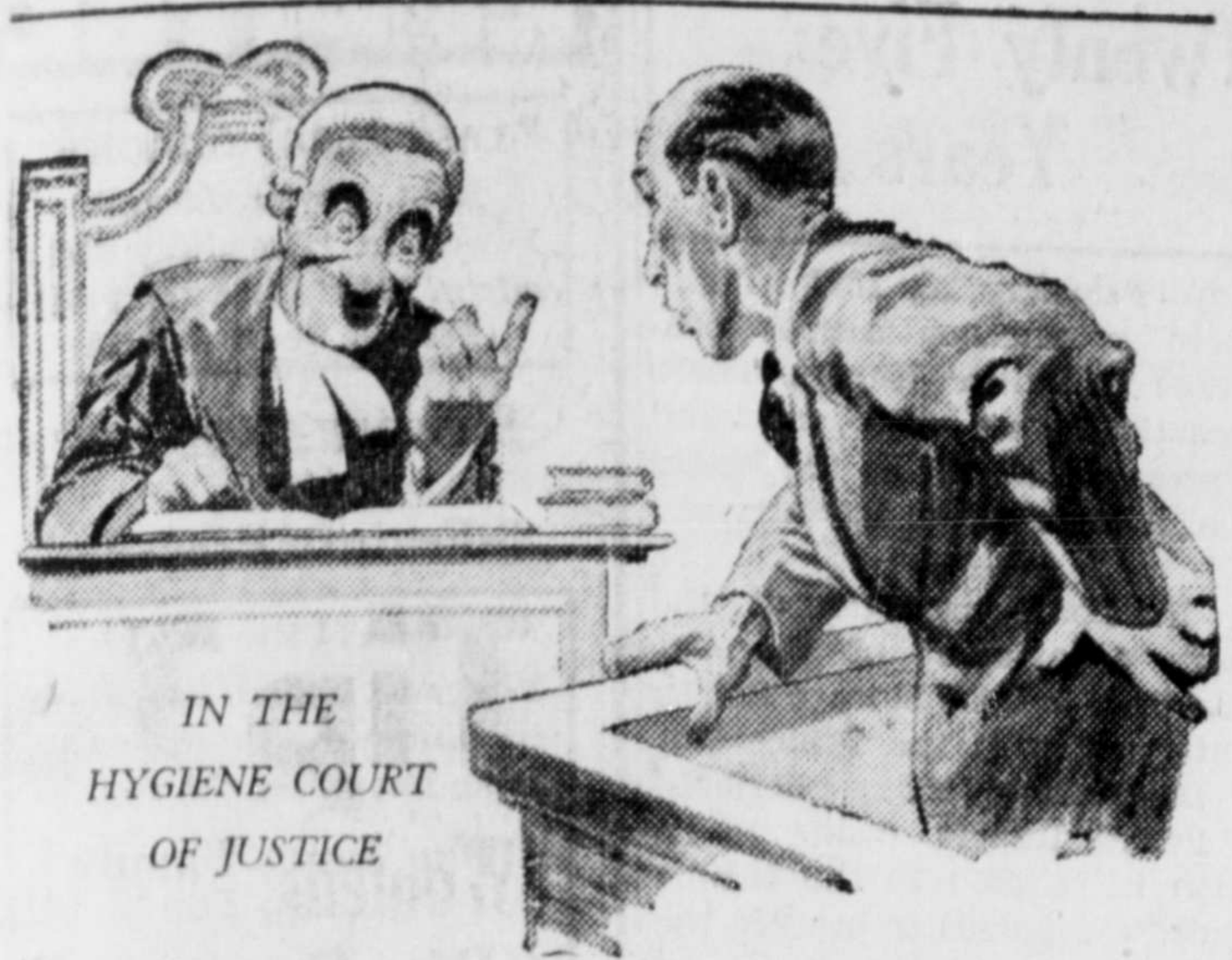
IN THE HYGIENE COURT OF JUSTICE