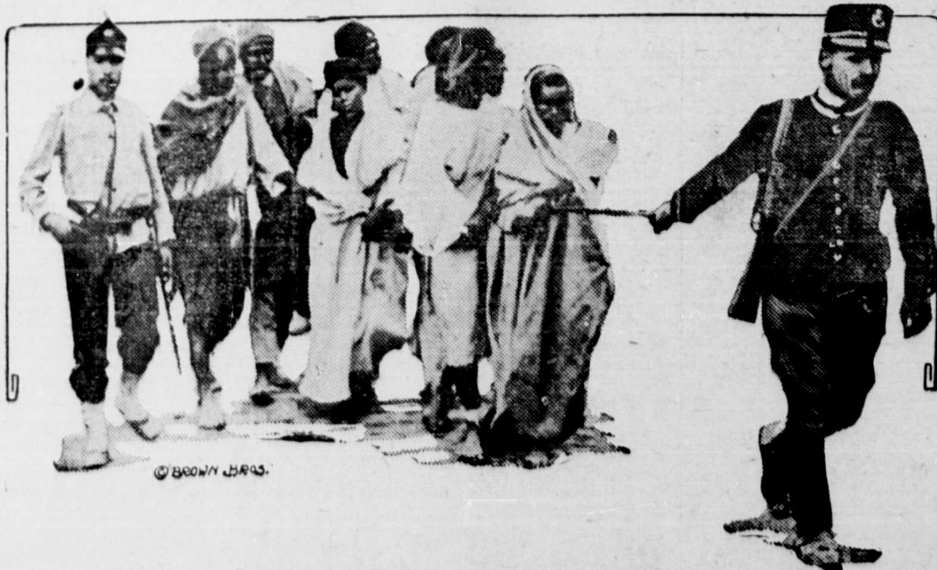
ITALIAN SOLDIERS LEADING ARAB MEN, WOMEN AND CHILDREN TO BE SHOT TO DEATH BY THE FIRING SQUAD WITHOUT EVEN A DRUMHEAD COURT-MARTIAL.