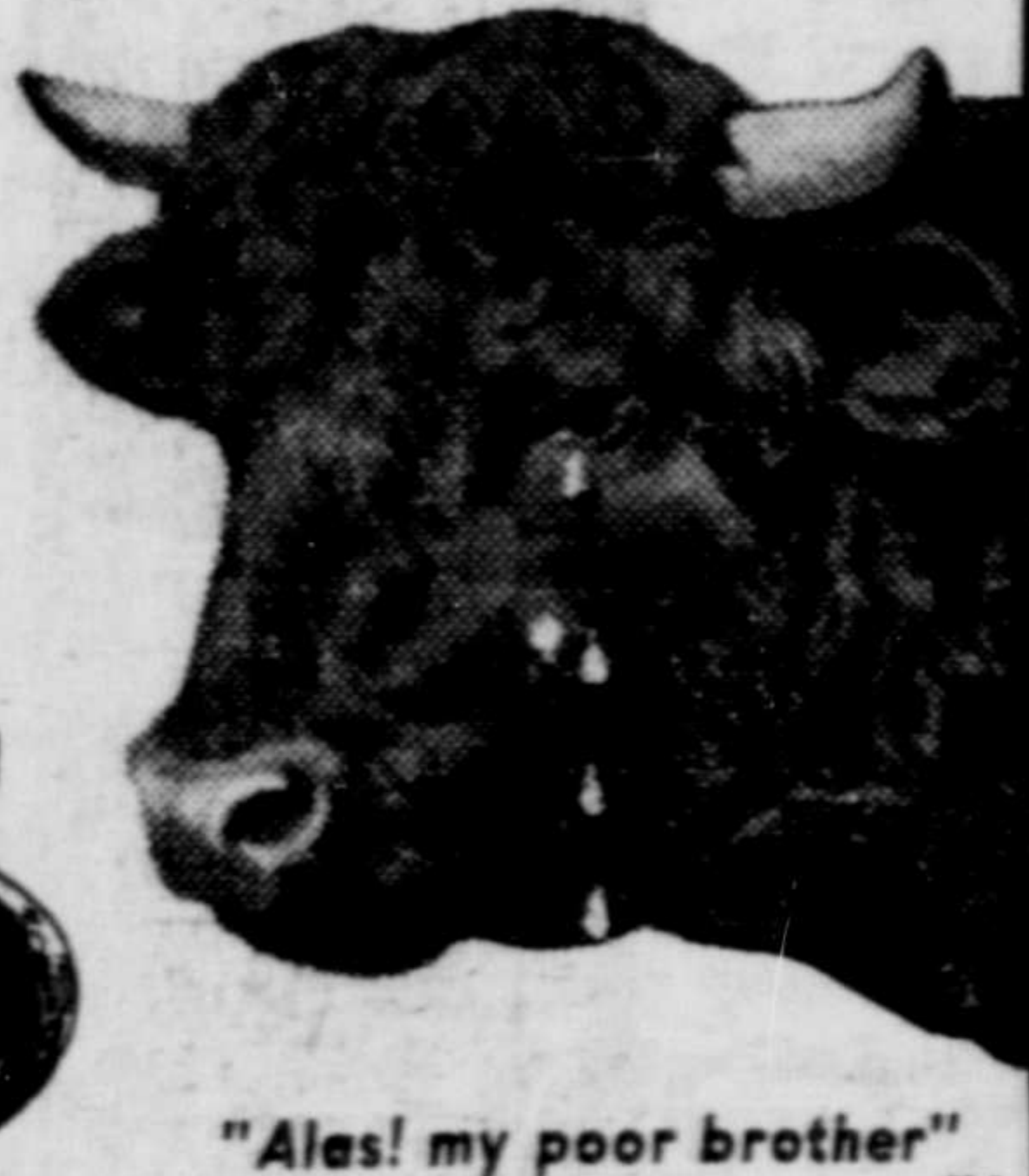
"Ales! my poor brother"