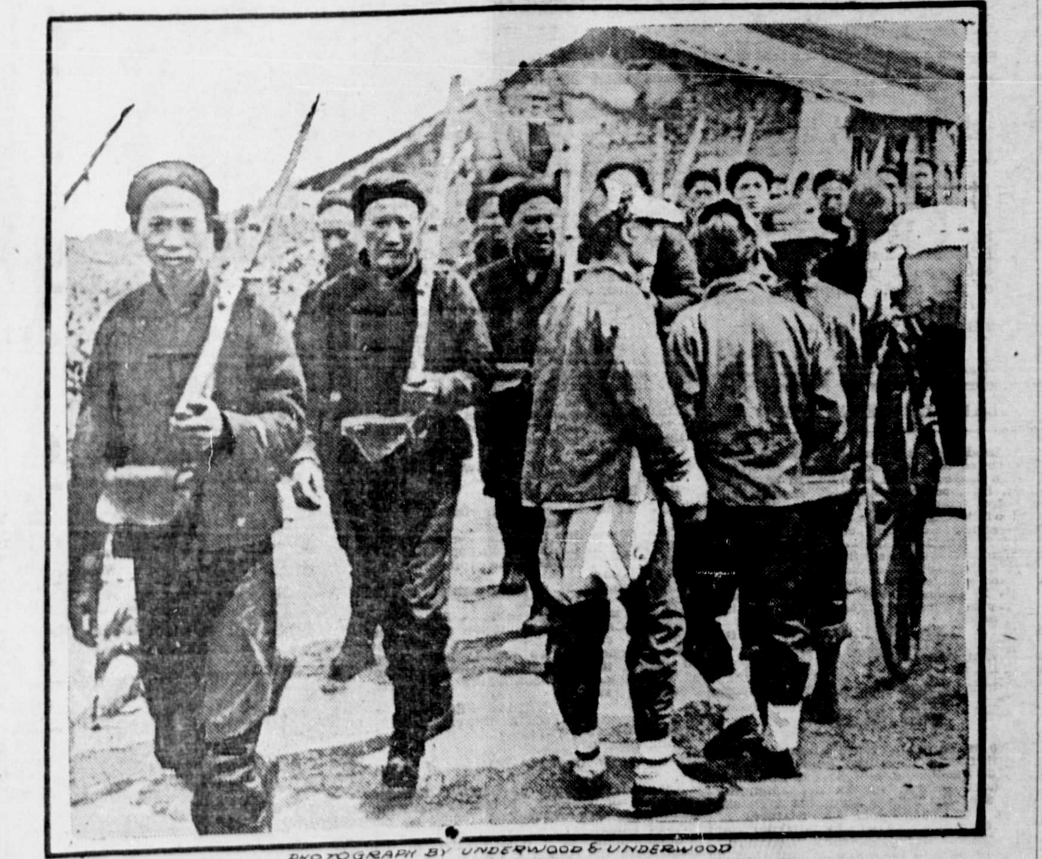
FIGHTING A BATTLE FOR LARGER LIBERTY.

The above picture has just reached here from China and shows some of the revolutionary troops embarking from Nanking on a special train for the scene of fighting. The Chinese soldiers they are fighting are no longer ill-clad, opium-dazed, semi-savage. They are well-drilled, well-fed, well-clad and well-motivated. The success of the revolutionary army is due to the support of the Chinese people.