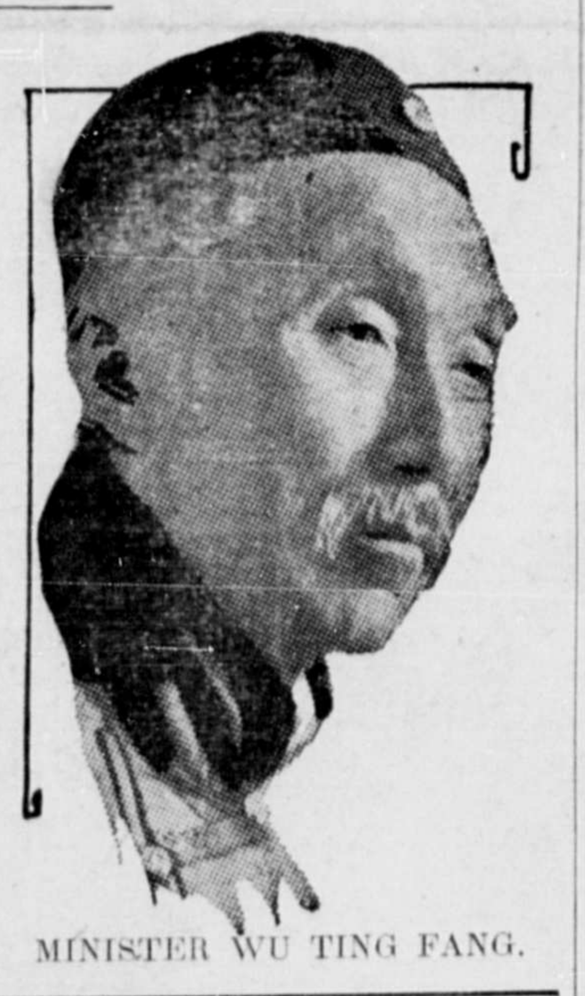
MINISTER WU TING FANG.

(Canadian Press Despatch.) Shanghai, Jan. 3.—Fighting is still taking place in Hankow today and the rebels are greatly outnumbered. Sun Yat Sen has inaugurated provisional president today and has named his cabinet, which includes Wu Ting Fang. Reports from Peking state that the Empress Dowager and the Imperial court has fled to Jehol. Practically the whole of the Imperial army in Shan Su has deserted to the rebels and a march on Peking has already started. The general opinion is there will be no opposition until the walls of the capital are reached. A meeting of the property owners of Section 2 will be held in the City Police Court on January 5th at 8 p. m. All those interested are requested to attend.