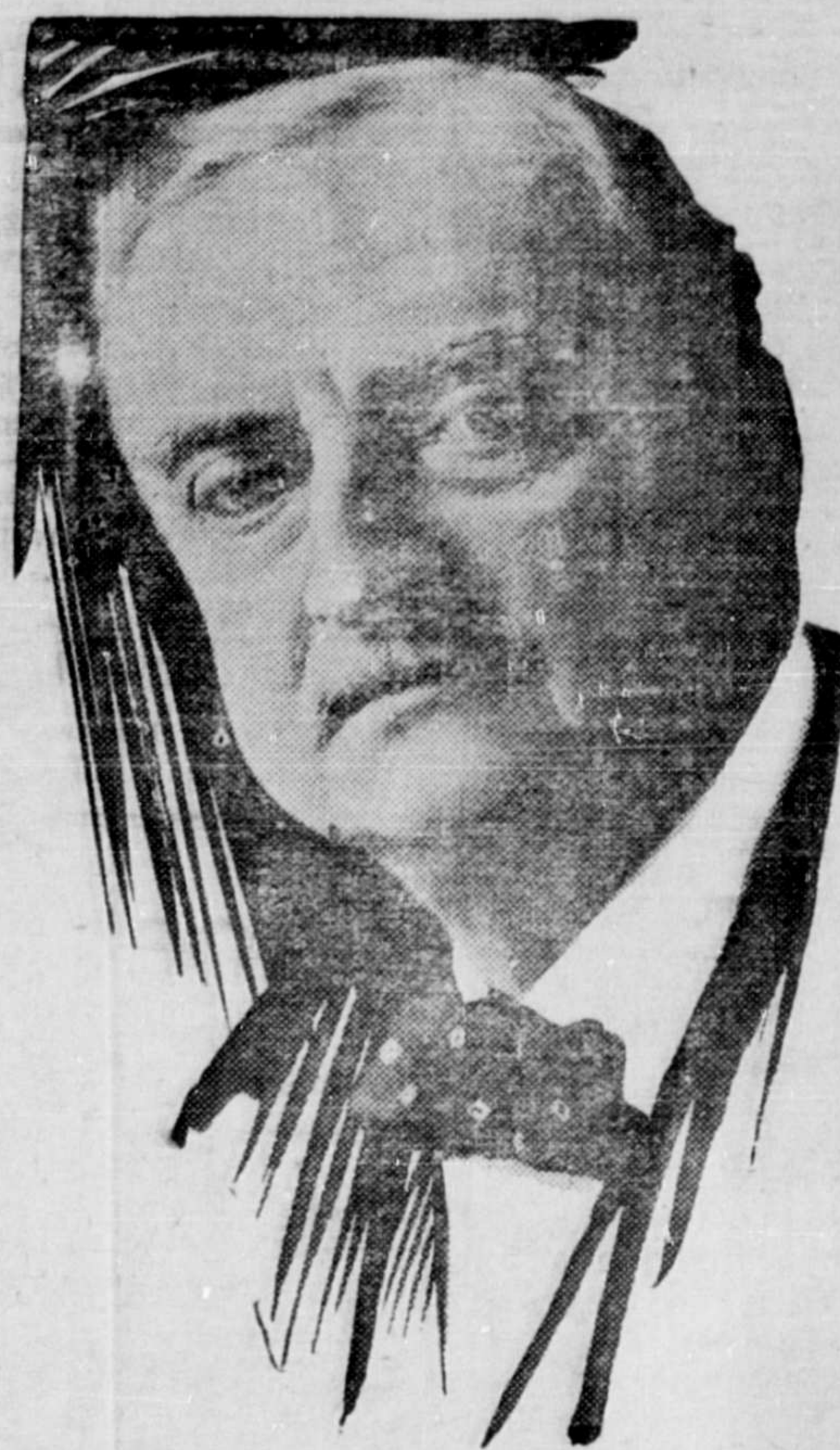
MR. JOHN REDMOND.

The financial question is the crux of the Home Rule struggle. One hundred and ten years after the abolition of the Irish Parliament its taxes had been doubled while its population had been reduced one-half. Ireland, a poor country, must bear an unjust share of the enormous levies made necessary by England's imperial policies and her fear of Germany. Ireland must pay the enormous cost of maintaining the police that patrols the island, not as ordinary police, but as an army of occupation. Ireland is tired of being milked to build British battleships. That's why Ireland wants Home Rule.—John Redmond.