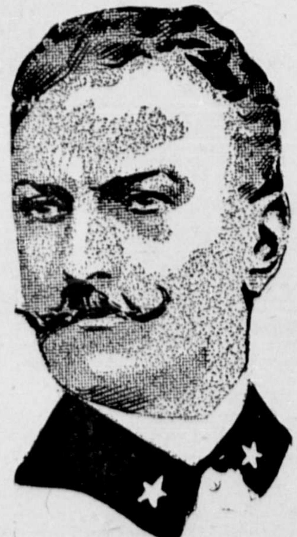
GENERAL CANEVA, In charge of the Italian troops at Tripoli.

Twenty-four Hour Battle Was Fought at the Close of the Old Year at Tobruk Near Tripoli