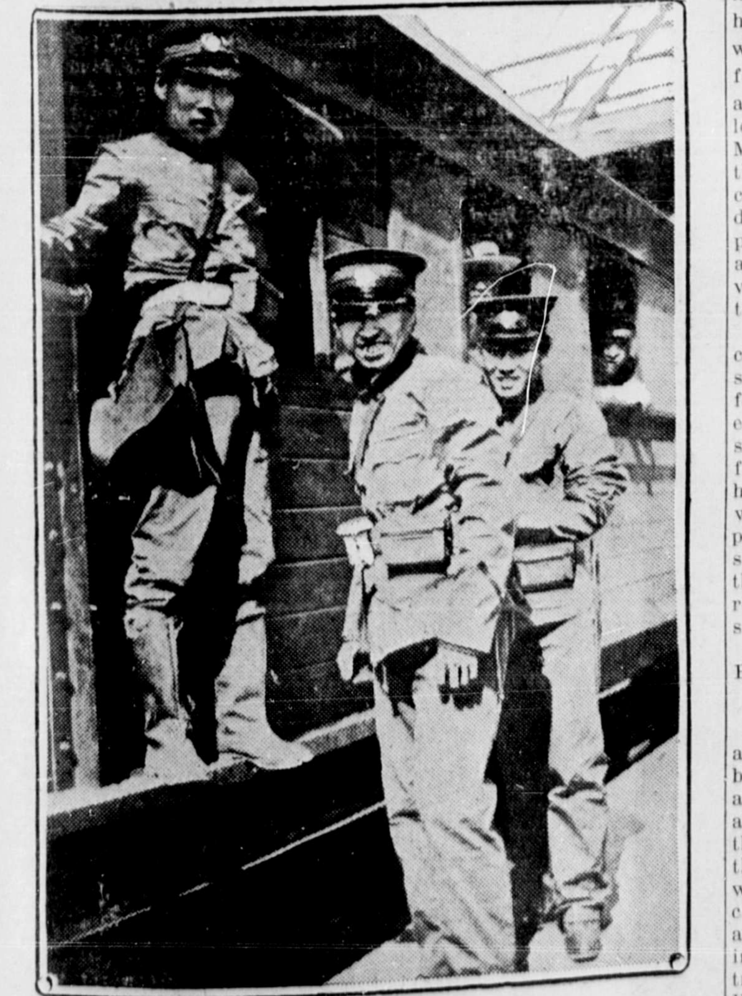
Are Fighting for the Eaby Emperor. The soldier in the modern Chinese army is a well equipped and smartly uniformed man and can render a good account of himself in battle. The picture, snapped in the railway station at Pekin, shows some of the regulars going to the front to meet the rebels. In many cases, however, the men have themselves gone over to the rebel ranks.