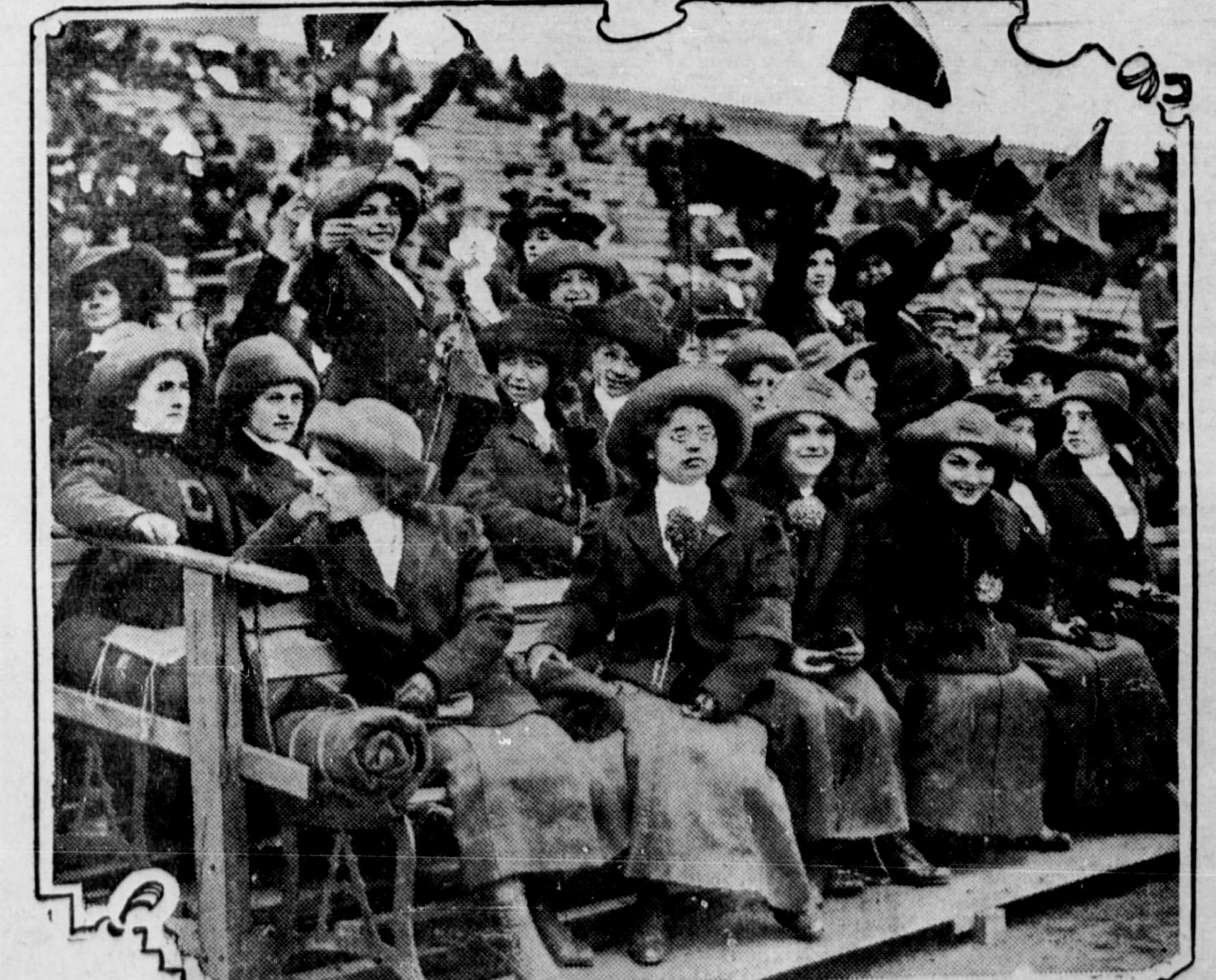
Don't accept the statement that the American Indian is a stoic until you have looked upon the above picture—a photograph showing a group of Carlisle Indian school girls cheering the school's famous football eleven. The girls are intensely interested in the plying of the team and many attend the games and cheer their representatives on to victory.