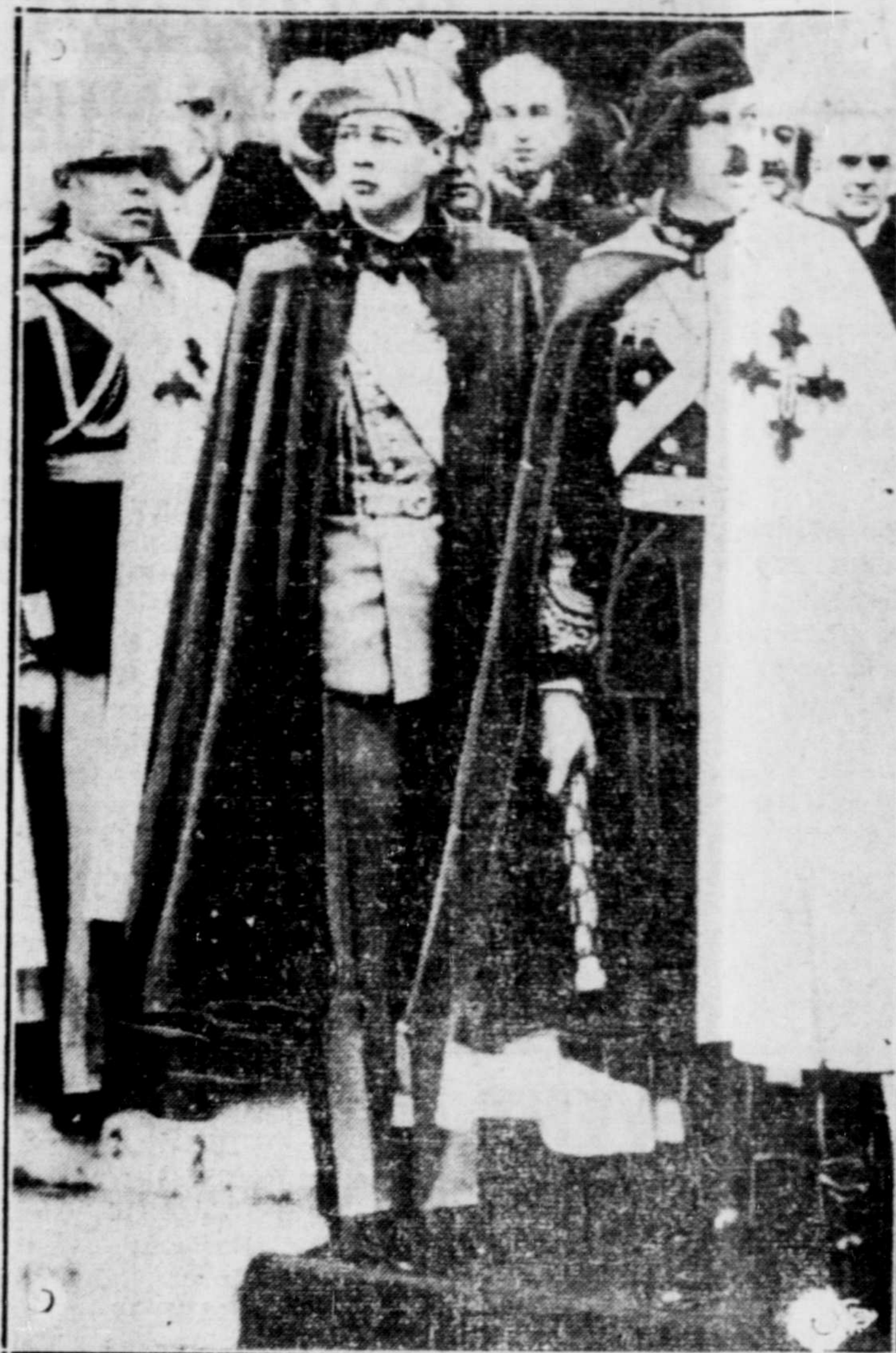
King Carol of Roumania is pictured here in resplendent uniform as he left the cathedral at Bucharest with Crown Prince Michael. Latest reports indicate that Carol intends to fight for his red-haired sweetheart, Magda Lupescu, for whom he once gave up the throne. Meantime Carol has set up a virtual dictatorship in Roumania.