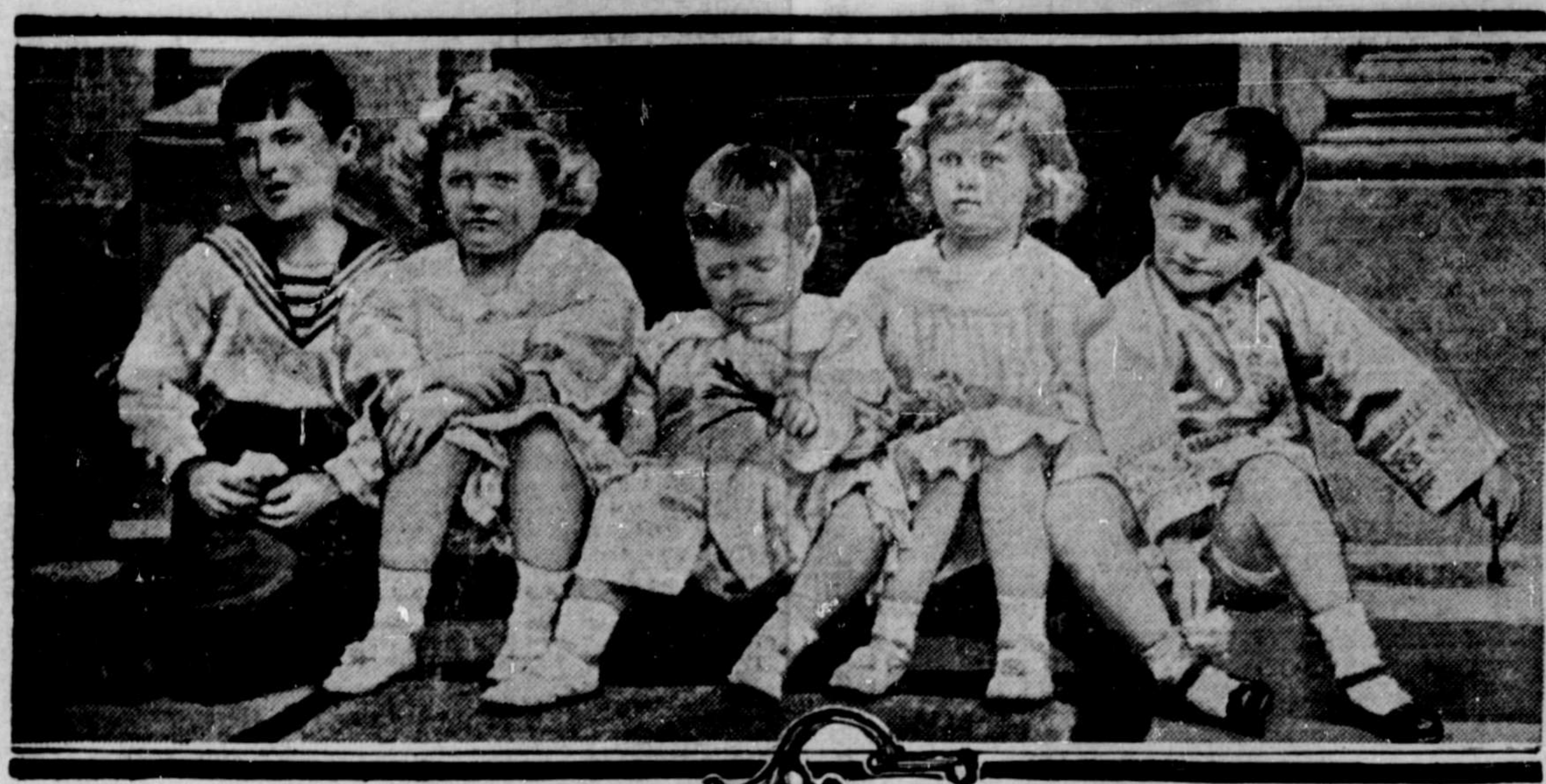
FIVE FUTURE KINGS AND QUEENS OF EUROPE

(Canadian Press Despatch) Vancouver, May 20.—The Liberals of British Columbia are said to have received private information from Ottawa to prepare for a Dominion election in the fall. At two annual ward meetings in this city the matter has been discussed, but at both the press were excluded. SHIPPING ON COAST Prince George Coming North to Arrive Sunday This morning Cape Lazo reported the S.S. Prince George passing north bound at 5.50 a.m. She will arrive on Sunday morning. Pachena spoke the S.S. Tees at 3 a.m. eastbound, and reports the S.S. Prince Rupert at 12.15 a.m. in Fitzhugh Sound southbound.