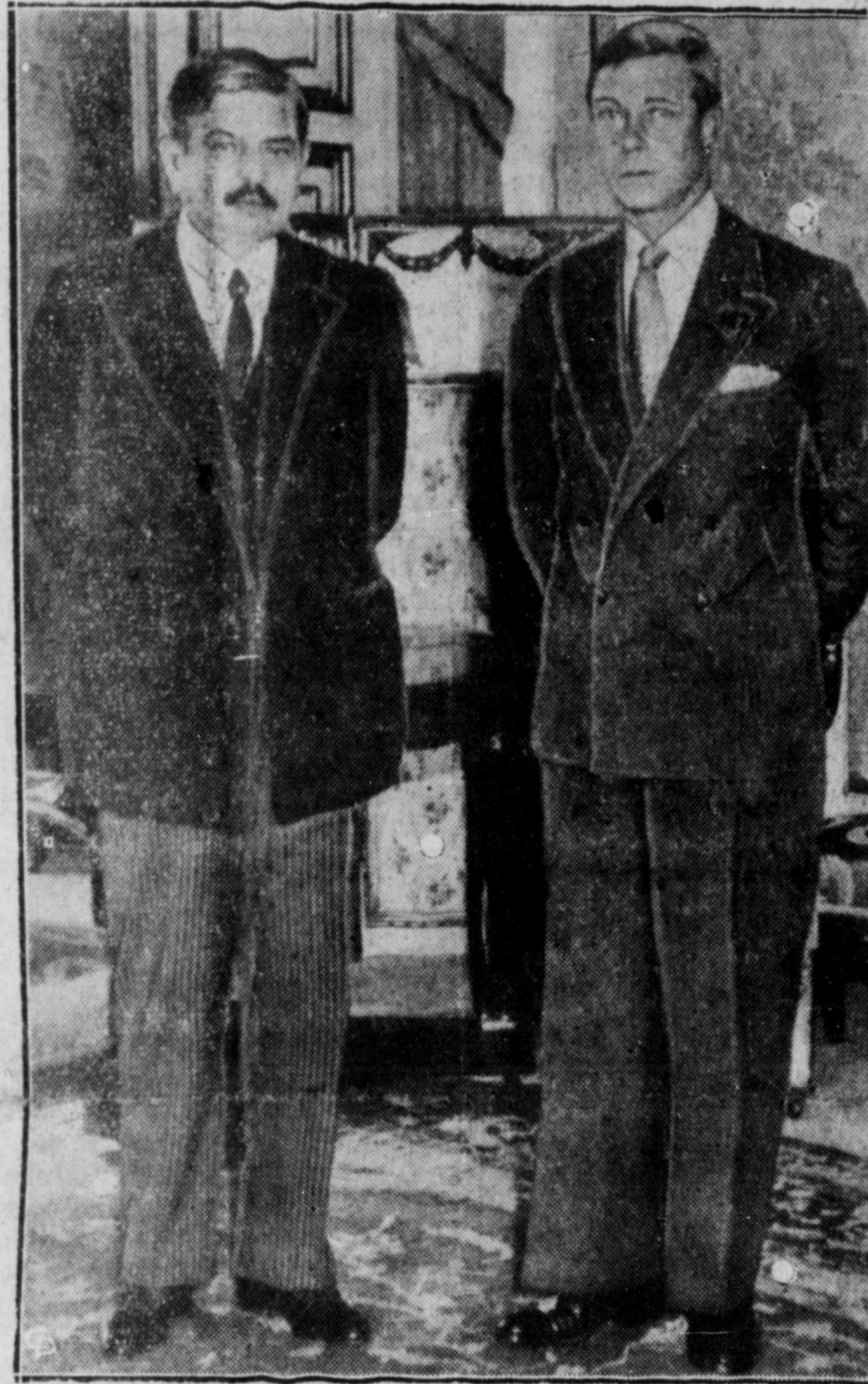
This photograph of Premier Pierre Laval of France in Paris and the Prince of Wales was made at the British embassy during a luncheon at which English and French leaders discussed international affairs informally. The Prince has shown an unusual interest in Britain's foreign affairs recently.