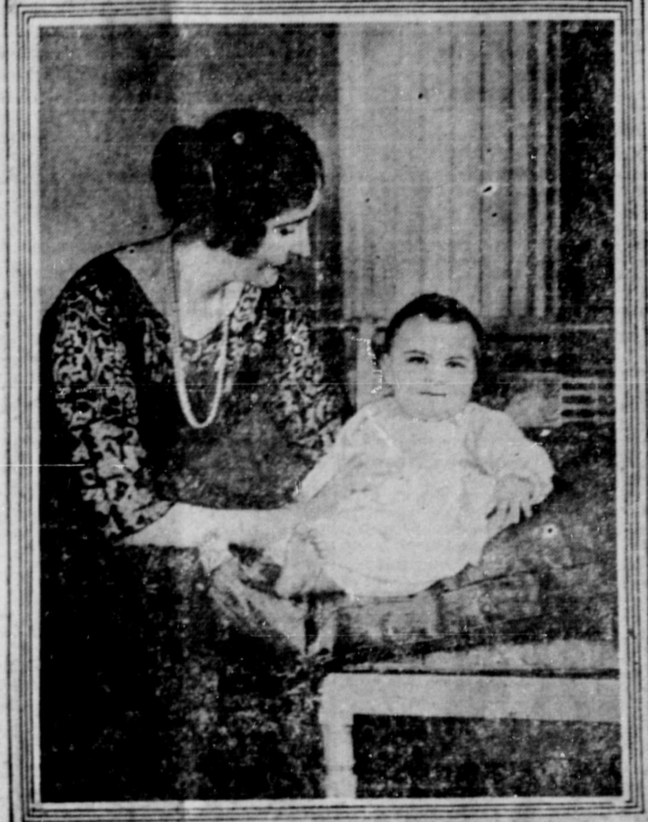
Lady Patricia Ramsay, who before her marriage to Commander Ramsay, of the British navy, was the much sought Juliet of many Romeos. She is shown with her little son. As a daughter of the Duke of Connaught, then Governor General of Canada, she was the sponsor of the famous Princess Pat Regiment of the Canadian army.