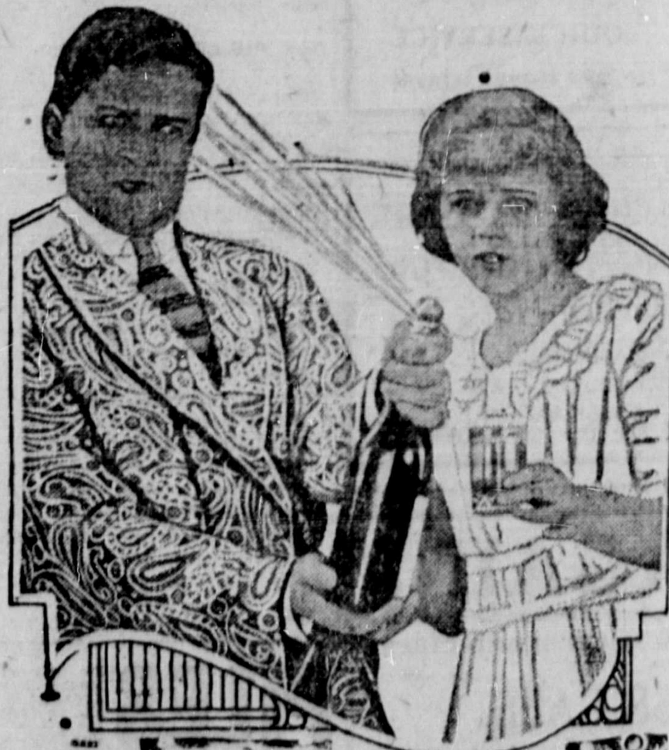
BRYANT WASHBURN and WANDA HAWLEY in a scene from "THE SIX BEST CELLARS" A PARAMOUNT ARTCRAFT PICTURE At the Empress Theatre tonight

M.T. LEE LADIES' AND GENTLEMEN'S TAILOR 270 OAK STREET THIRD AVENUE Opposite Post Office Phone Red 130