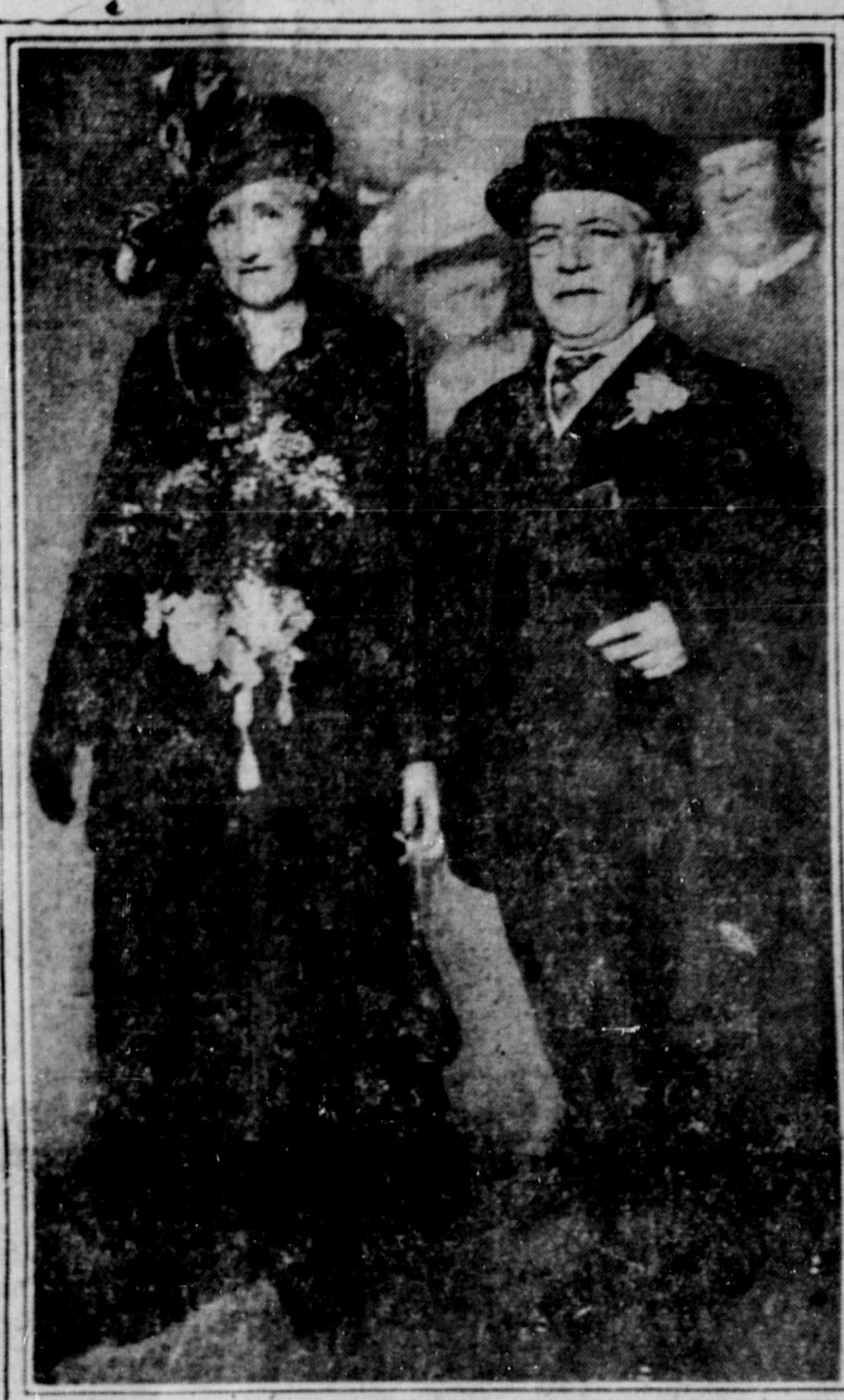
SAMUEL GOMPERS AND HIS BRIDE.