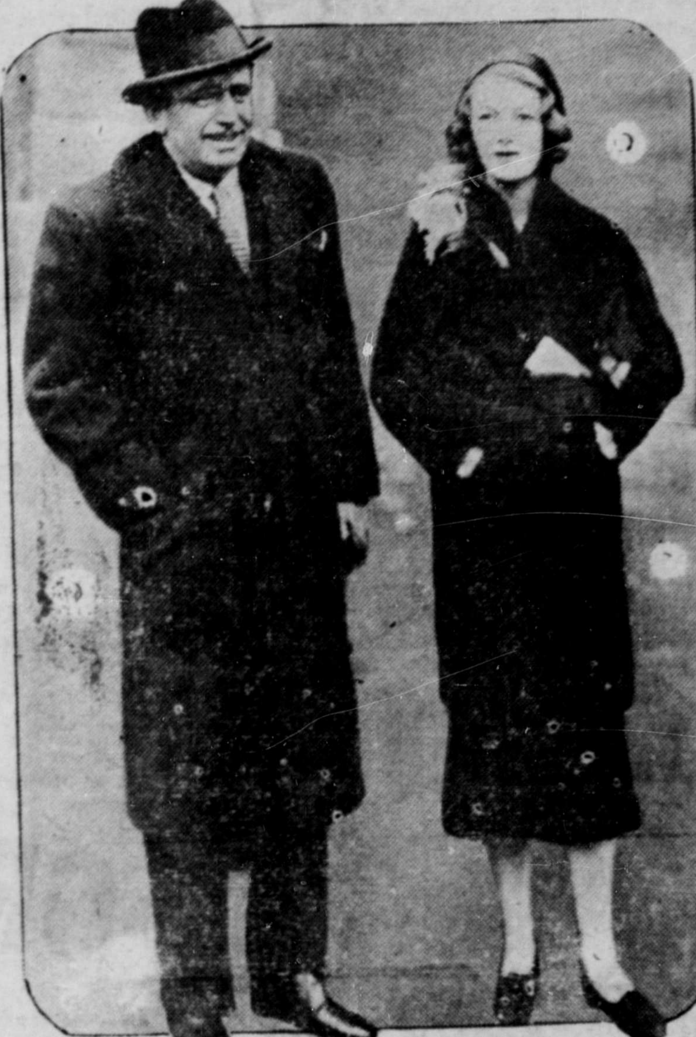
DOUGLAS FAIRBANKS SR. HOLLYWOOD, December 12: (CP)—Douglas Fairbanks Sr. died today from a heart attack, at the age of fifty-six.