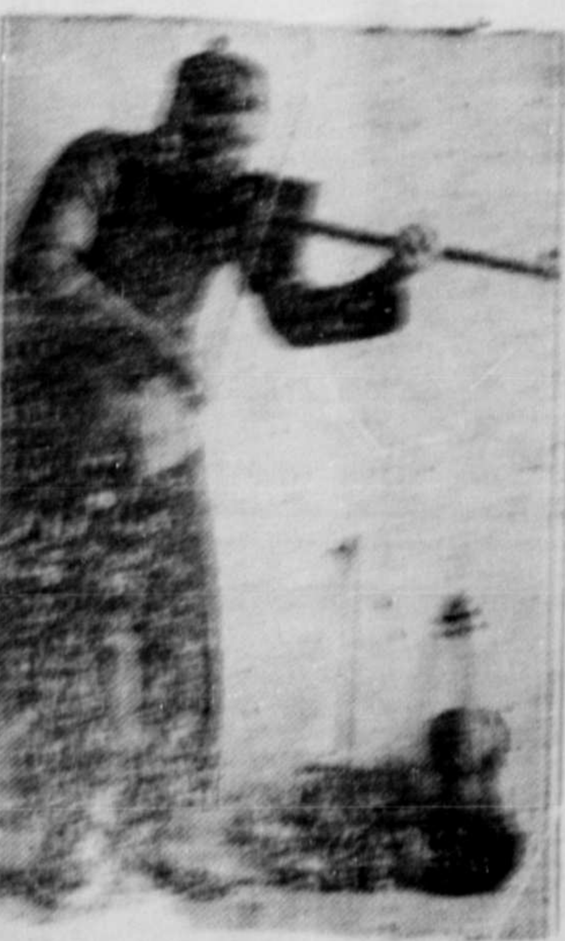
The musician with a soul and all his money one-string fiddles playing at the Moose Hall Friday night.