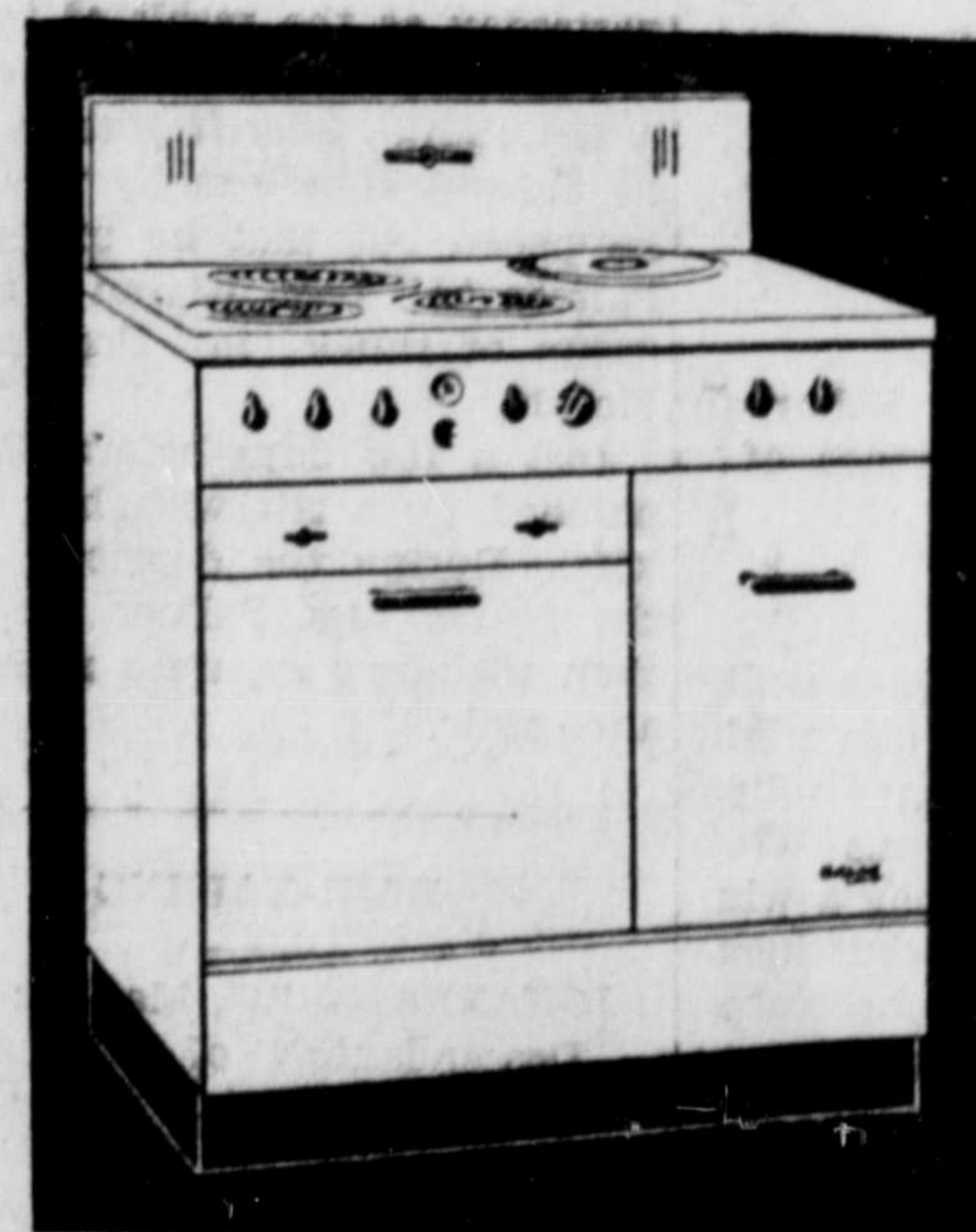
A beautiful new Electric Range like this G-E model can be installed in your kitchen for a small down payment. Balance on easy terms.

When you're "fed to the teeth" with coal and wood and the smoke of sulky fires gets in your eyes, and the heat upsets you, and the waste of overdone roasts gets you down... Turn over a new leaf... COOK WITH ELECTRICITY. Then just snap the switch and begin to really enjoy cooking.