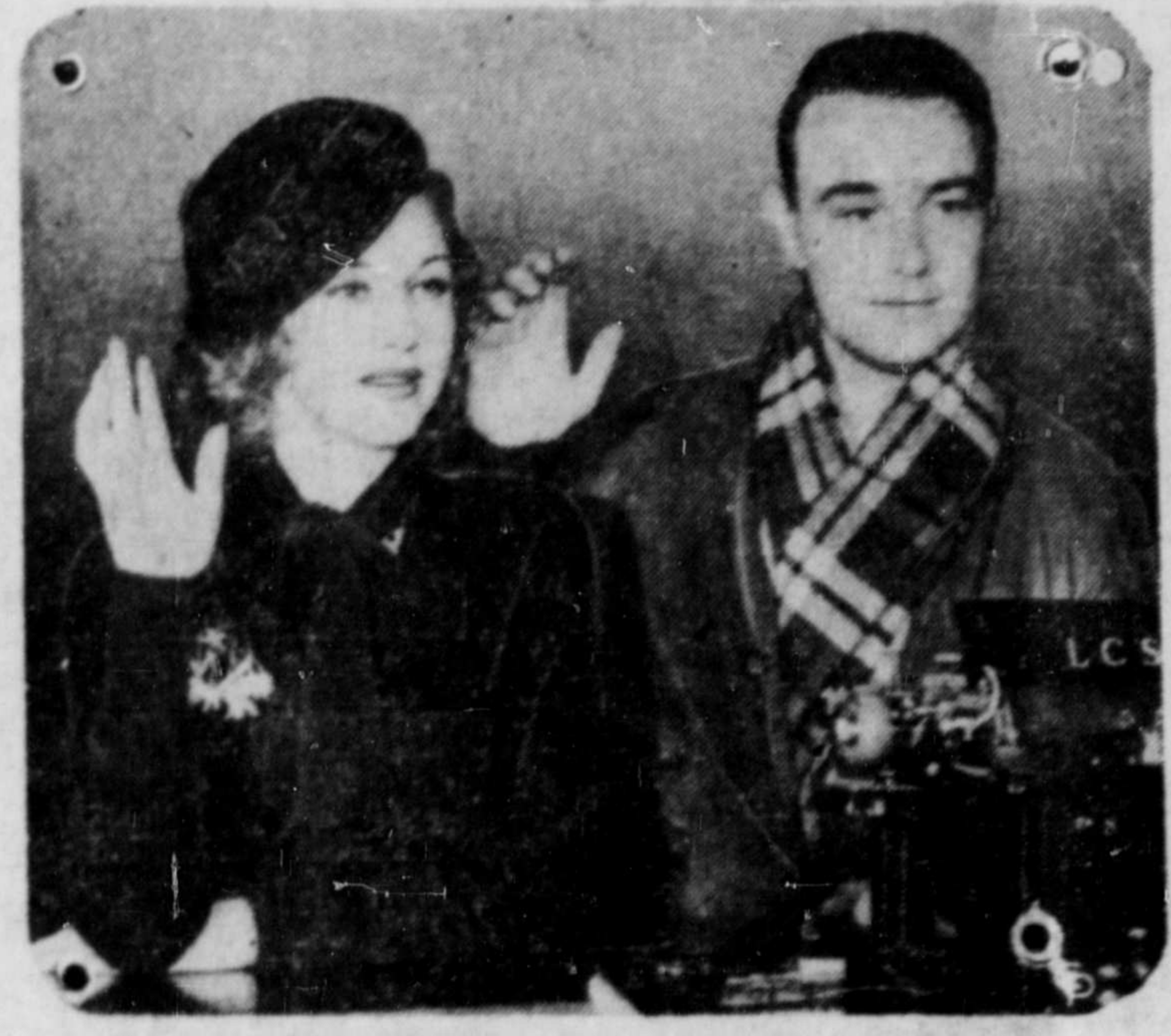
LEW AYRES and GINGER ROGERS HOLLYWOOD, April 17.—Ginger Rogers, it is reported, will shortly seek divorce from Lew Ayres from whom she has long been separated. Miss Rogers will marry a director, George Stephens.