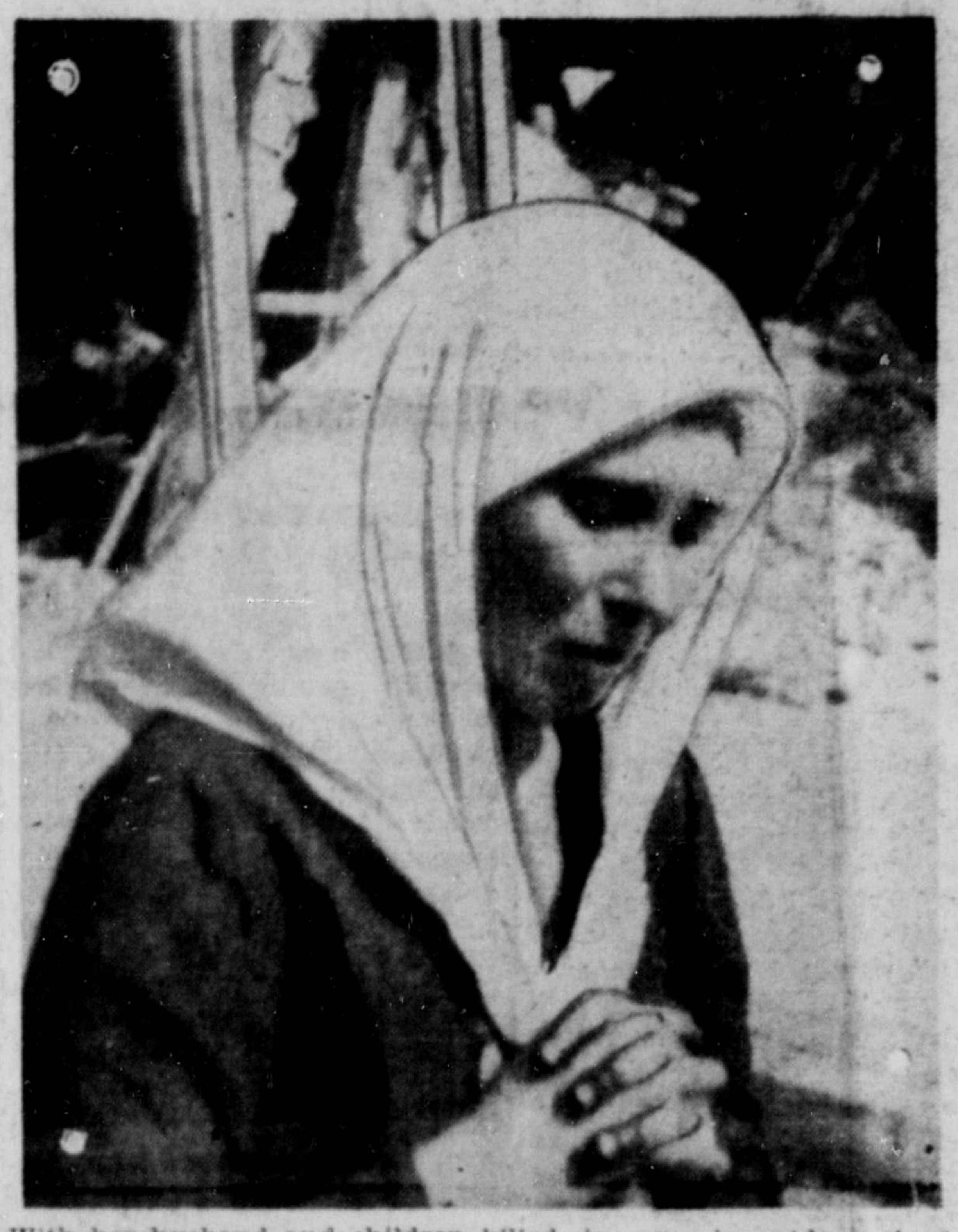
With her husband and children killed in an air raid a short time before this photograph was taken by an American photographer, a Polish peasant woman stands amidst the shambles of her bomb-wrecked home and prays.