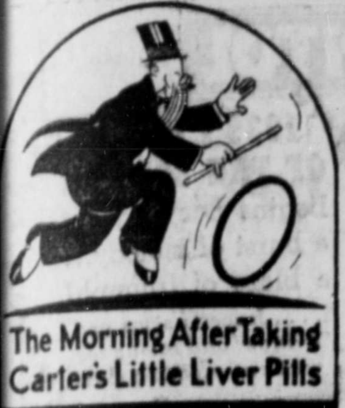
The Morning After Taking Carler's Little Liver Pills