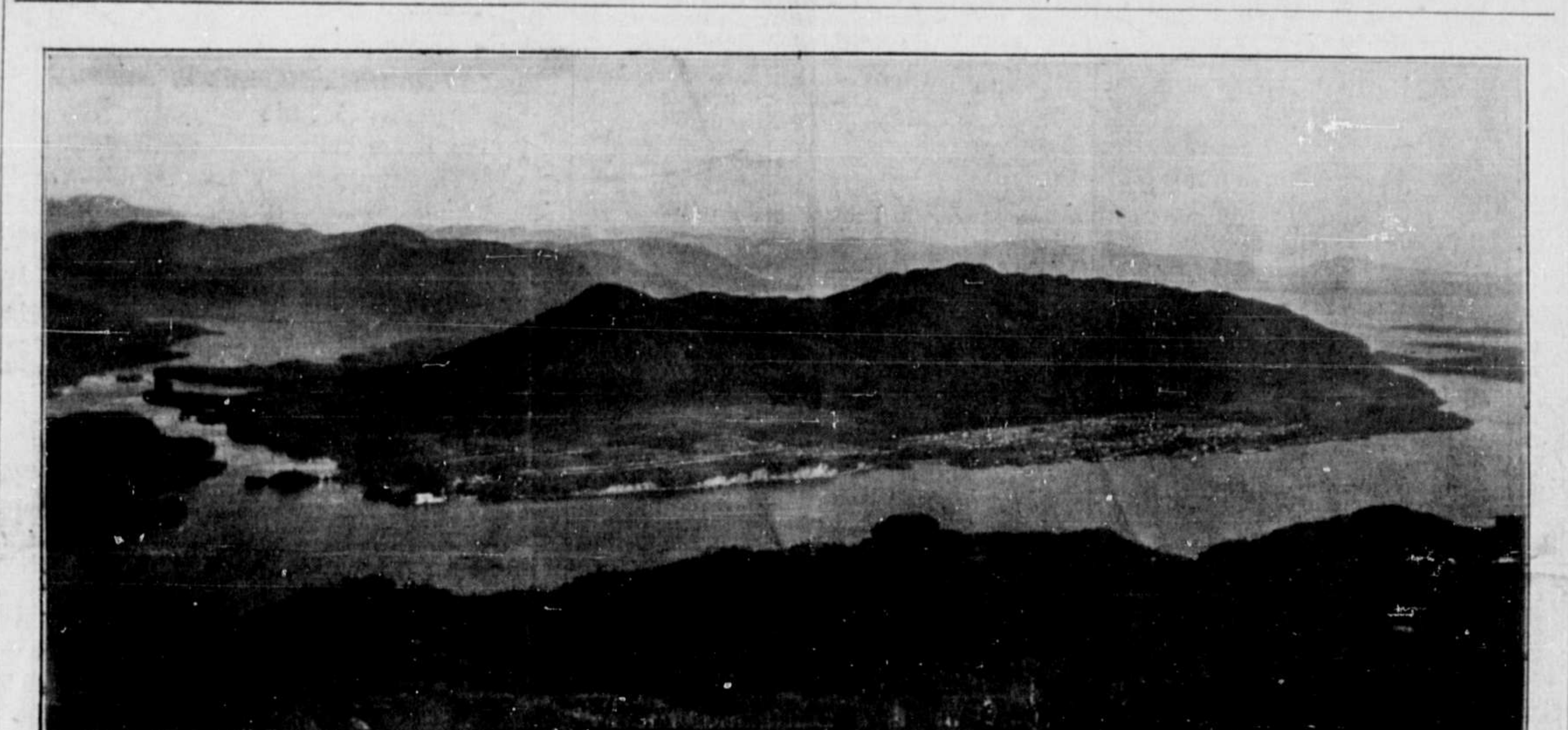
PRINCE RUPERT FROM MOUNT MORSE, SHOWING CONTOUR OF KAIEN ISLAND.

Of the five thousand present citizens of Prince Rupert, probably only one or two have ever seen the townsite as it looks in the picture reproduced above. The photograph was taken by P. Lorenzen under exceptionally fortunate circumstances, after an arduous climb to the summit of Mount Morse, across the harbor. There is only one point on the summit from which this view can be obtained, and one might easily make the trip to the top of the mountain and miss this vantage point.