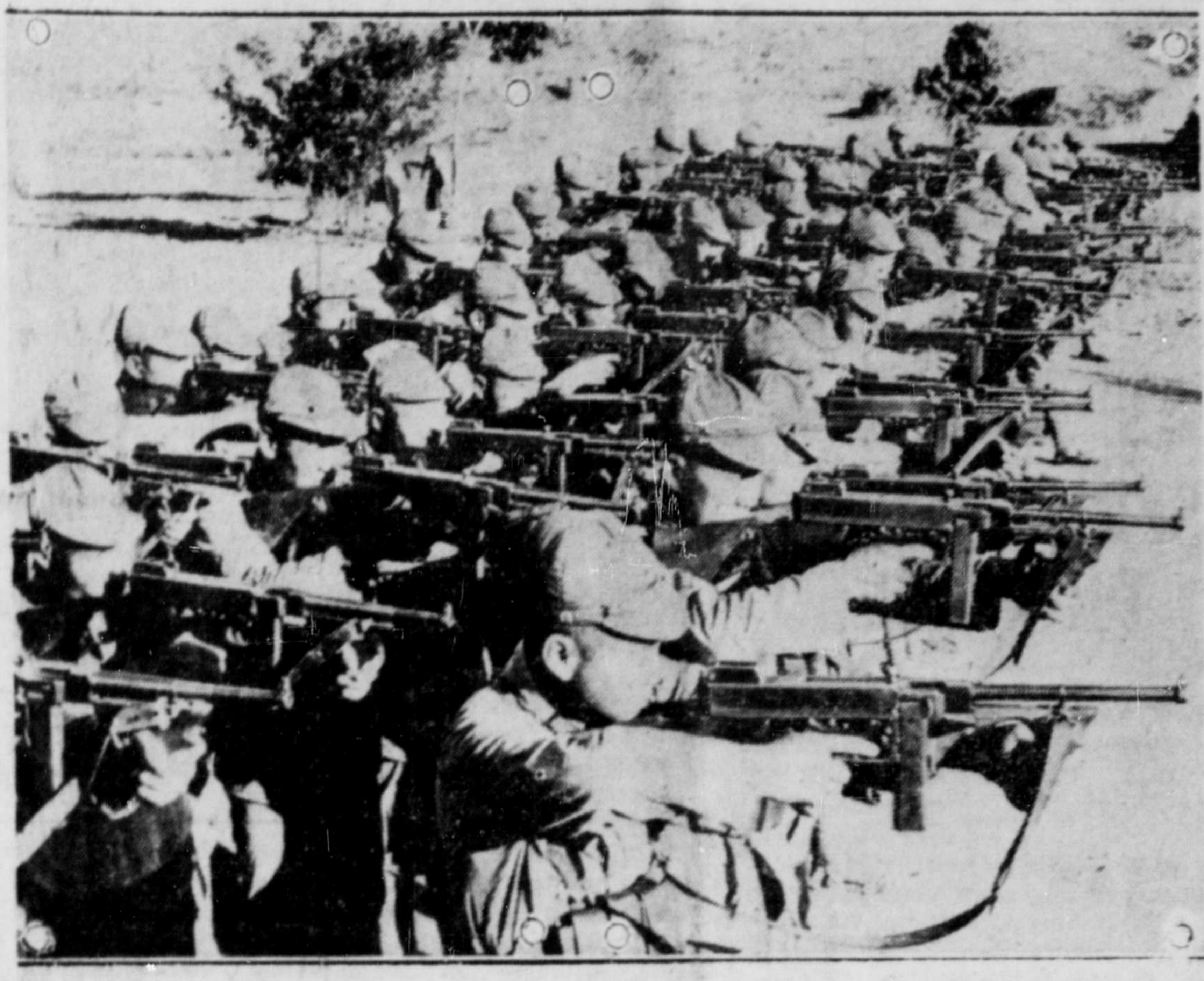
A remarkable picture, made by Harrison Forman, famous explorer and author of "Through Forbidden Tibet," showing a squad of Chinese Communists at drill with the latest thing in American-made Thompson sub-machine guns—replicas of the "Tommygun" made famous by American gangsters. These men, once hunted by the central government of Nanking, may now prove saviors of China, indications being that they'll do their bit to stop Japan.