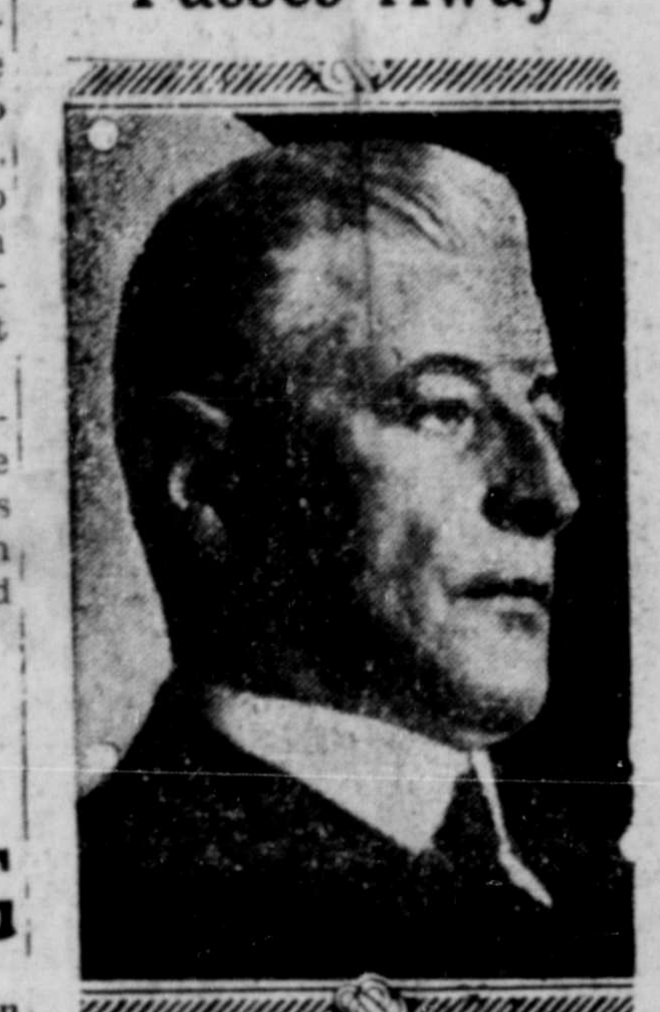
HON. HUGH GUTHRIE

Hon. Hugh Guthrie one of the most distinguished of Canada's elder statesmen. By some authorities he was ranked as one of the ablest parliamentarians of his day. His practical knowledge of procedure and his grasp of the constitution and of governmental problems in general made him at all times a leading figure.