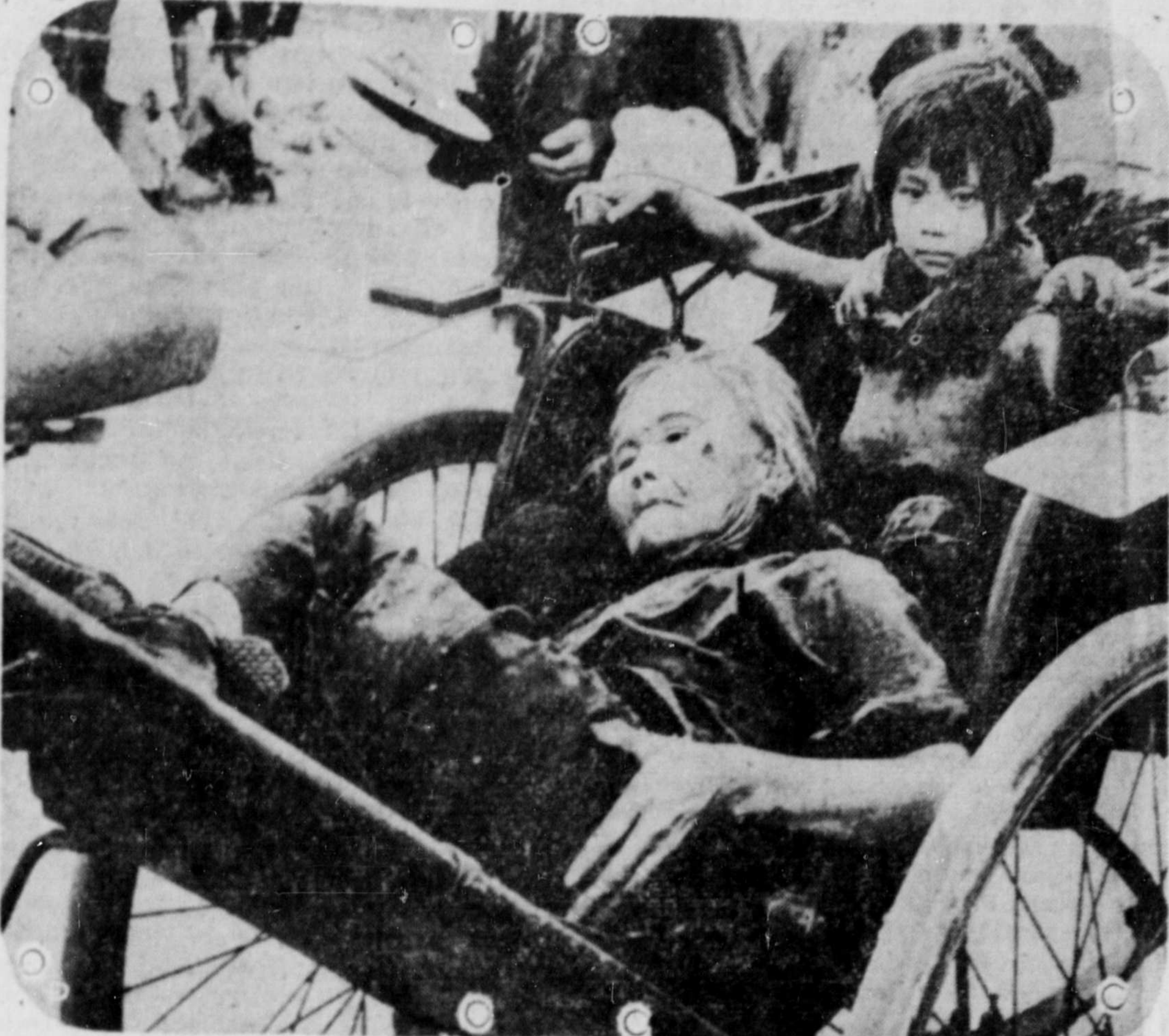
War, neither respecter of age nor caste, holds human life in little regard when military machines attempt capture of foreign goods or soil, as seen by the above photo. This aged woman and the little girl are only two of the many innocent victims of the Japanese invasion of their homeland. Their faces reflect the terror and hunger of war.