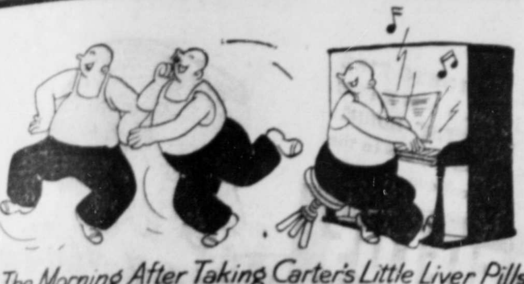
The Morning After Taking Carter's Little Liver Pills