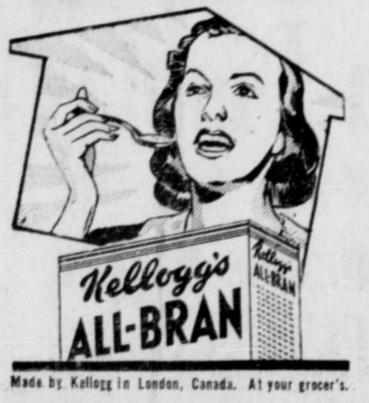
Made by Kellogg in London, Canada. At your grocer's.

EAT ALL-BRAN and THEY'LL WANT to DATE YOU