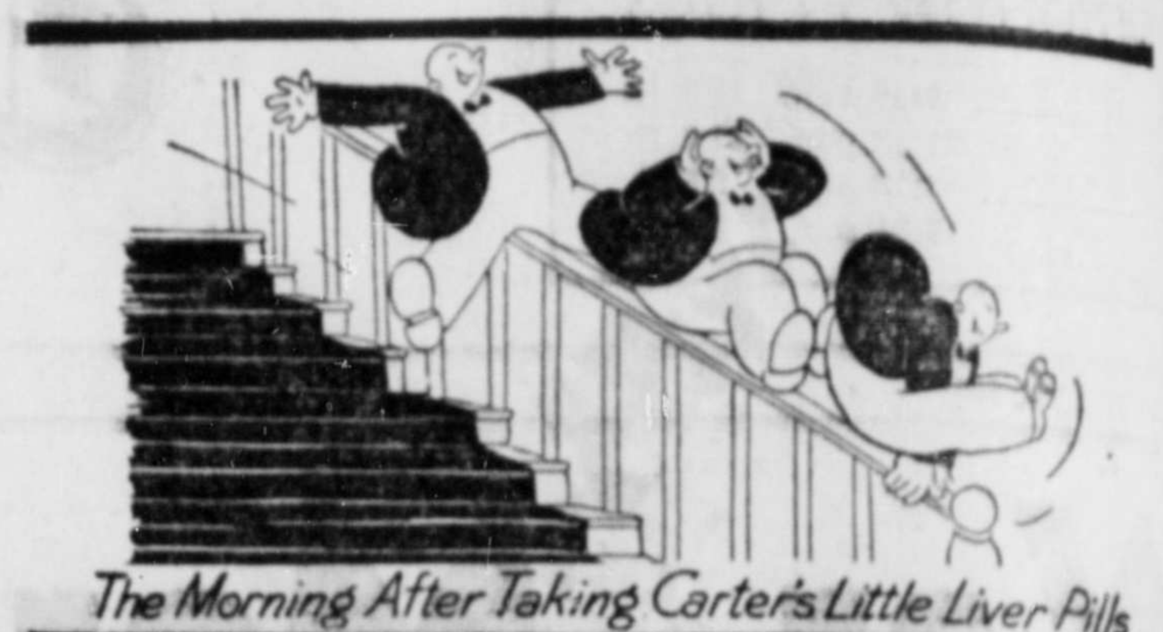
The Morning After Taking Carter's Little Liver Pills