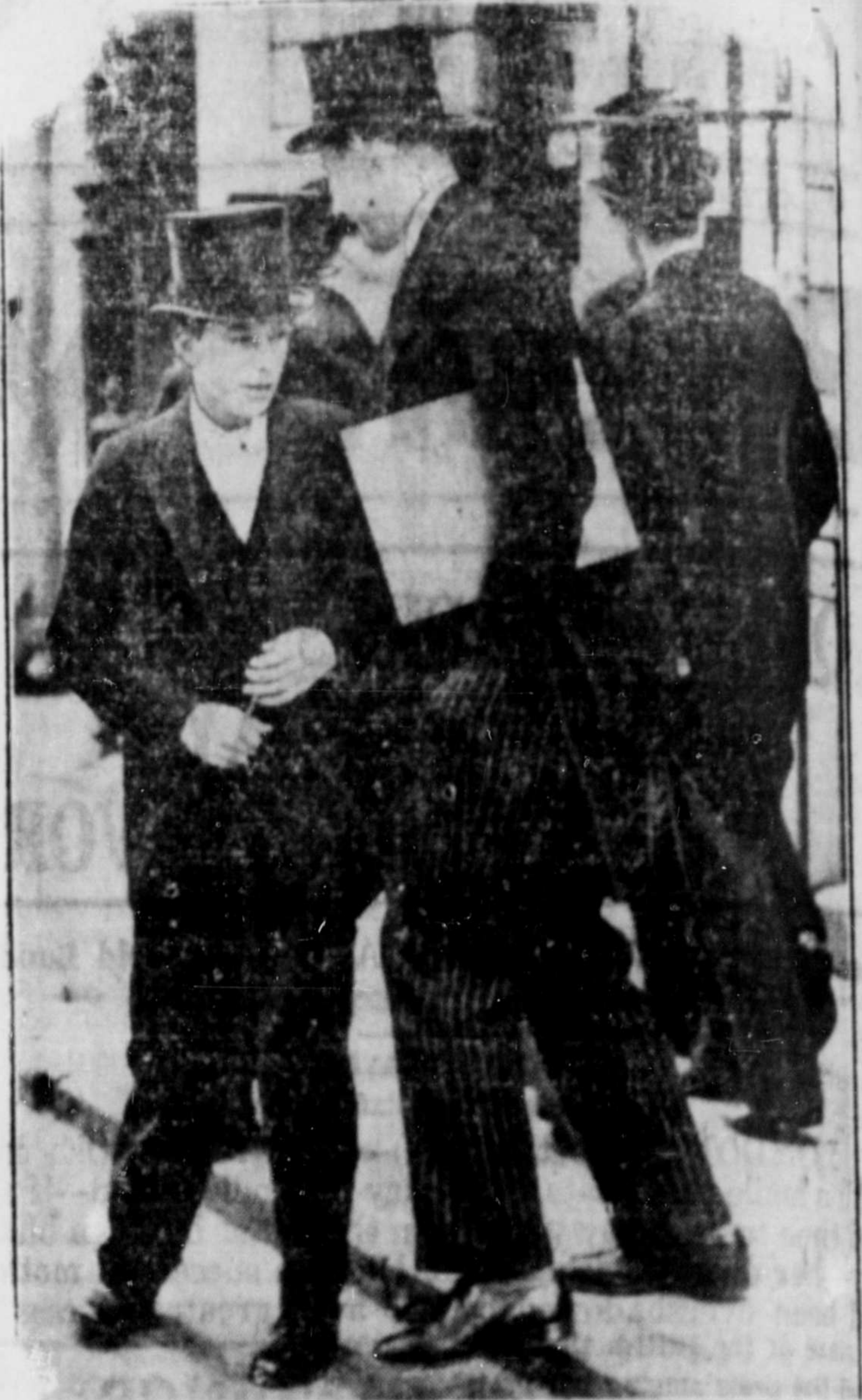
Viscounts Lascelles (left), 13-year-old son of the Earl of Harewood and the Princess Royal of England, pictured walking to his class at Eton, where he is a first-termer. Although he is the nephew of King George of England, the young viscount seems to be getting a bit of a pushing around in this picture, while upper classmen walk the sidewalk.