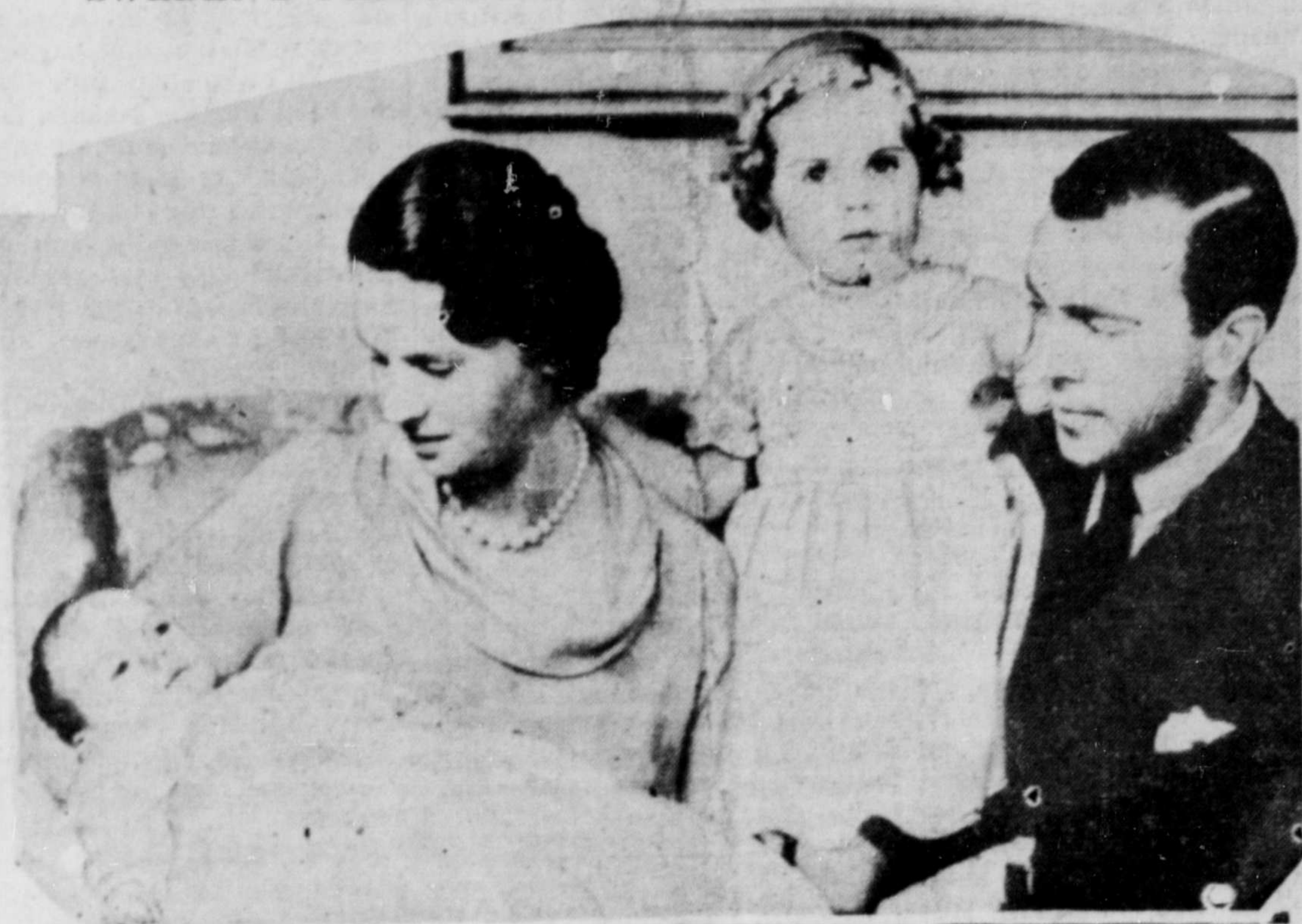
This charming group is that of Prince Gustav Adolf, eldest son and heir to the Crown of Sweden, and his wife, Princess Sibylla with their two children, Princess Margaretha and Princess Birgitta.