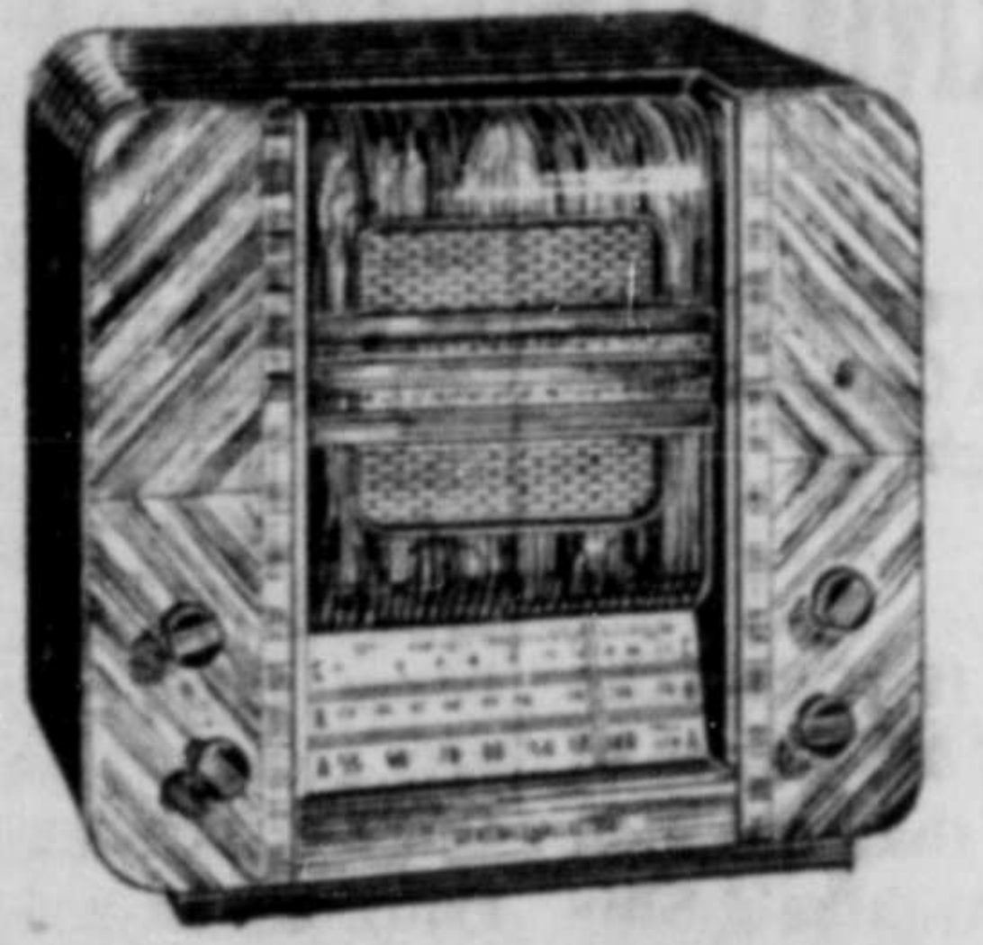
5 Tubes, $49.95

Roam the world at your ease by radio, with a new model receiver. Keep up-to-the-minute on the war and other vital world events. Enjoy all that is finest in the field of entertainment. Simplified push-button tuning that brings in distant stations with the ease and clarity of local, adds to your pleasure. Wide range of models for every budget, each in a gorgeous cabinet.