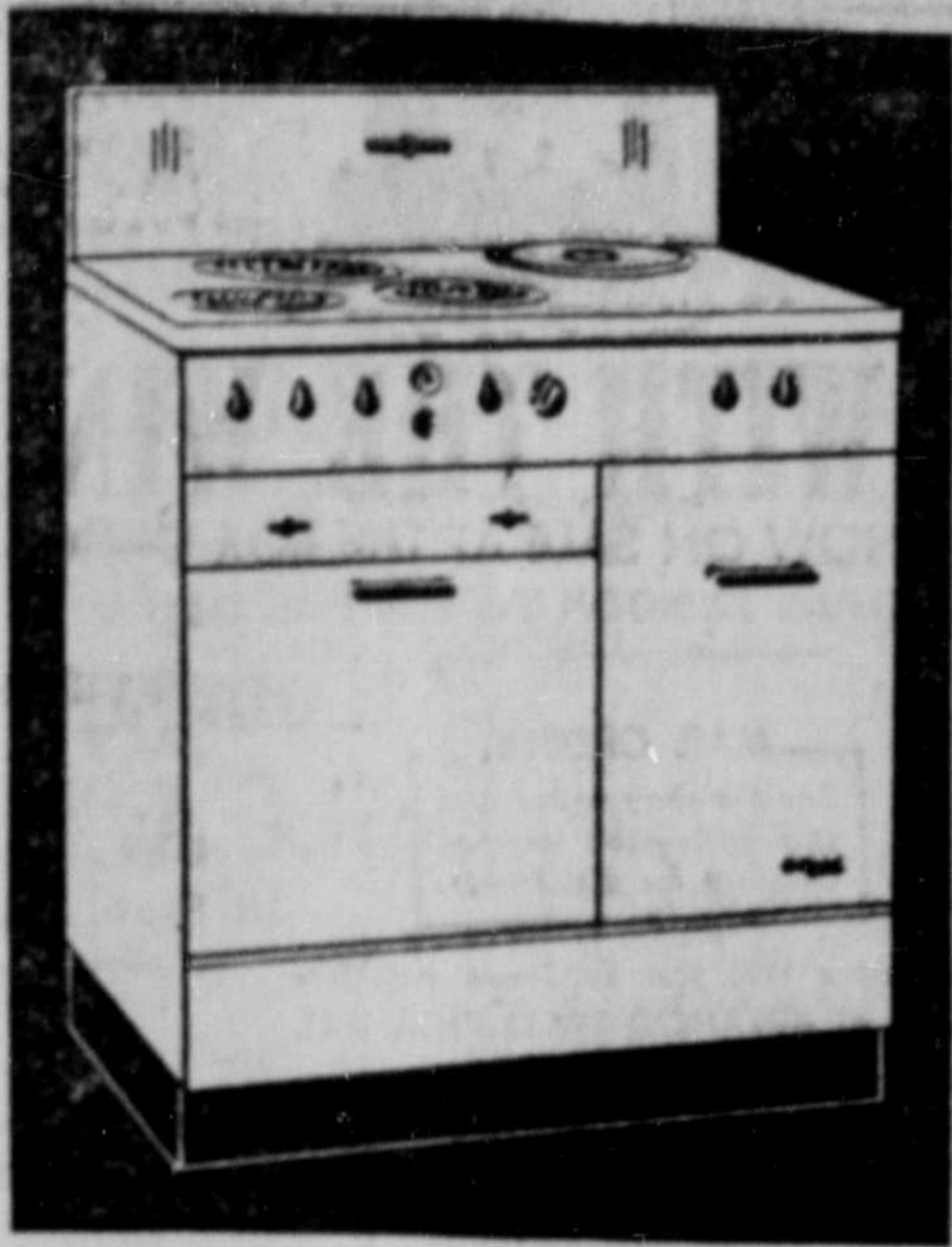
A beautiful new Electric Range like this G-E model can be installed in your kitchen for a small down payment. Balance on easy terms.

When you're "fed to the teeth" with coal and wood and the smoke of sulky fires gets in your eyes, and the heat upsets you, and the waste of overdone roasts gets you down... Turn over a new leaf... COOK WITH ELECTRICITY. Then just snap the switch and begin to really enjoy cooking.