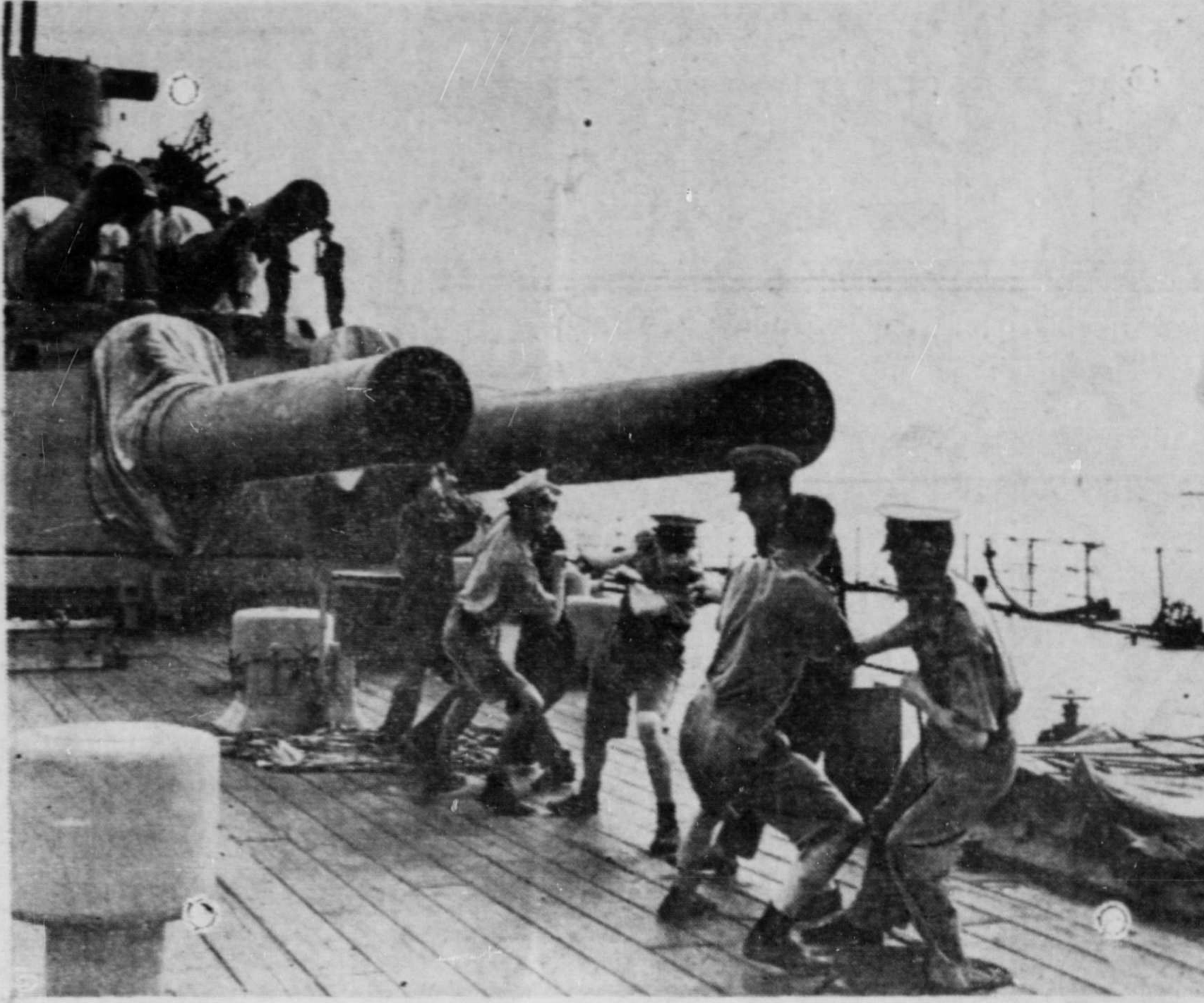
British marines are shown drawing huge sponges and wire brushes through one of the big guns of an English battleship following the bombardments of Forts Capuzzo and Bardia recently. Note the smokesmudged muzzles of the usually spotless and gleaming cannon. Diligent cleaning and care of these weapons assures their longer useful life and accuracy of fire.