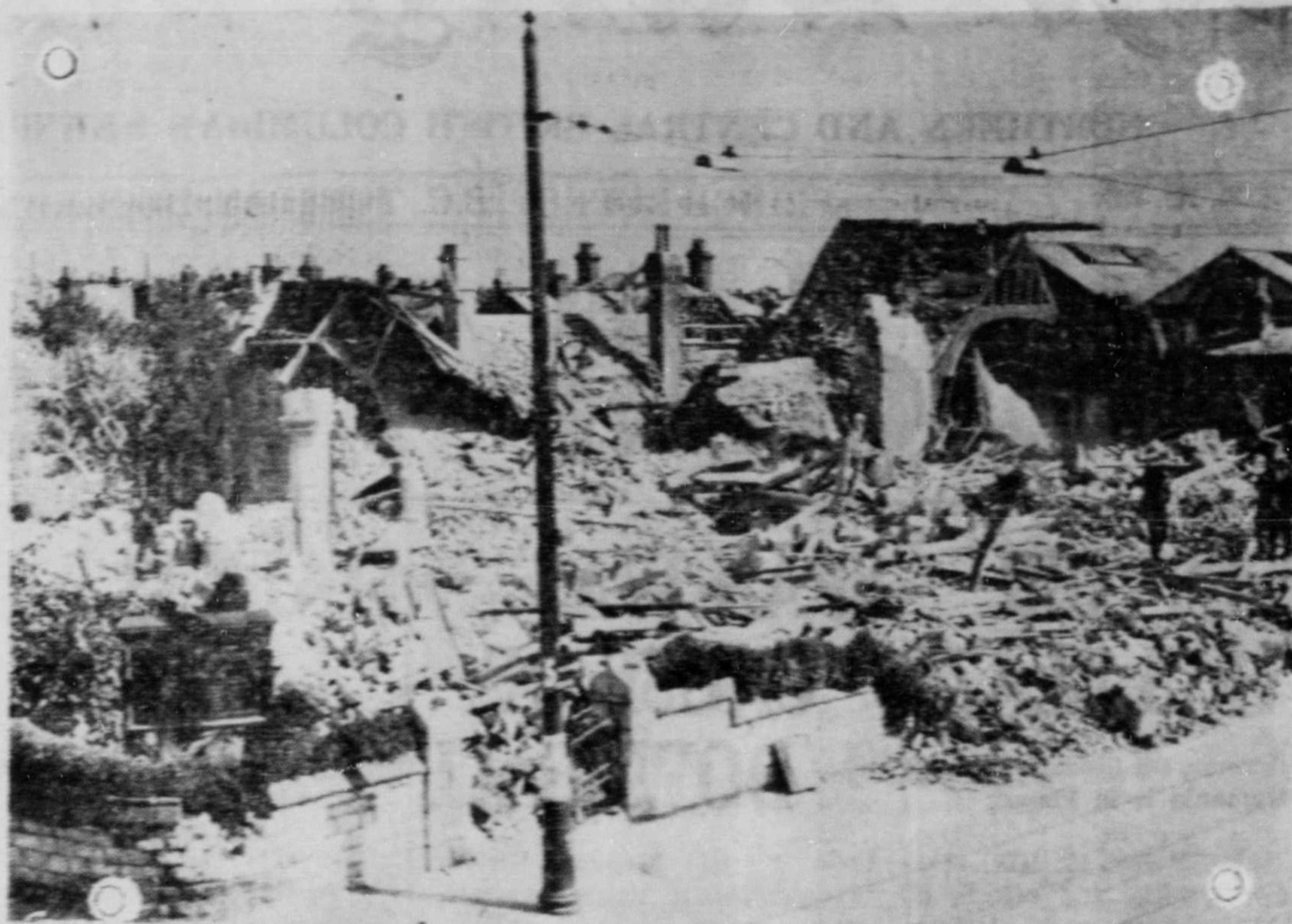
All that is left of St. Barnabas Church in Southampton is this pile of rubble and the church directory board, setting forth the hours of divine services. Southampton, great southeastern port of England, has been the target of repeated bombings by the German raiders. In the so-called "Hell's Corner" of England, it bore the brunt of bomb storms before the Germans began the business of "demolishing" London.