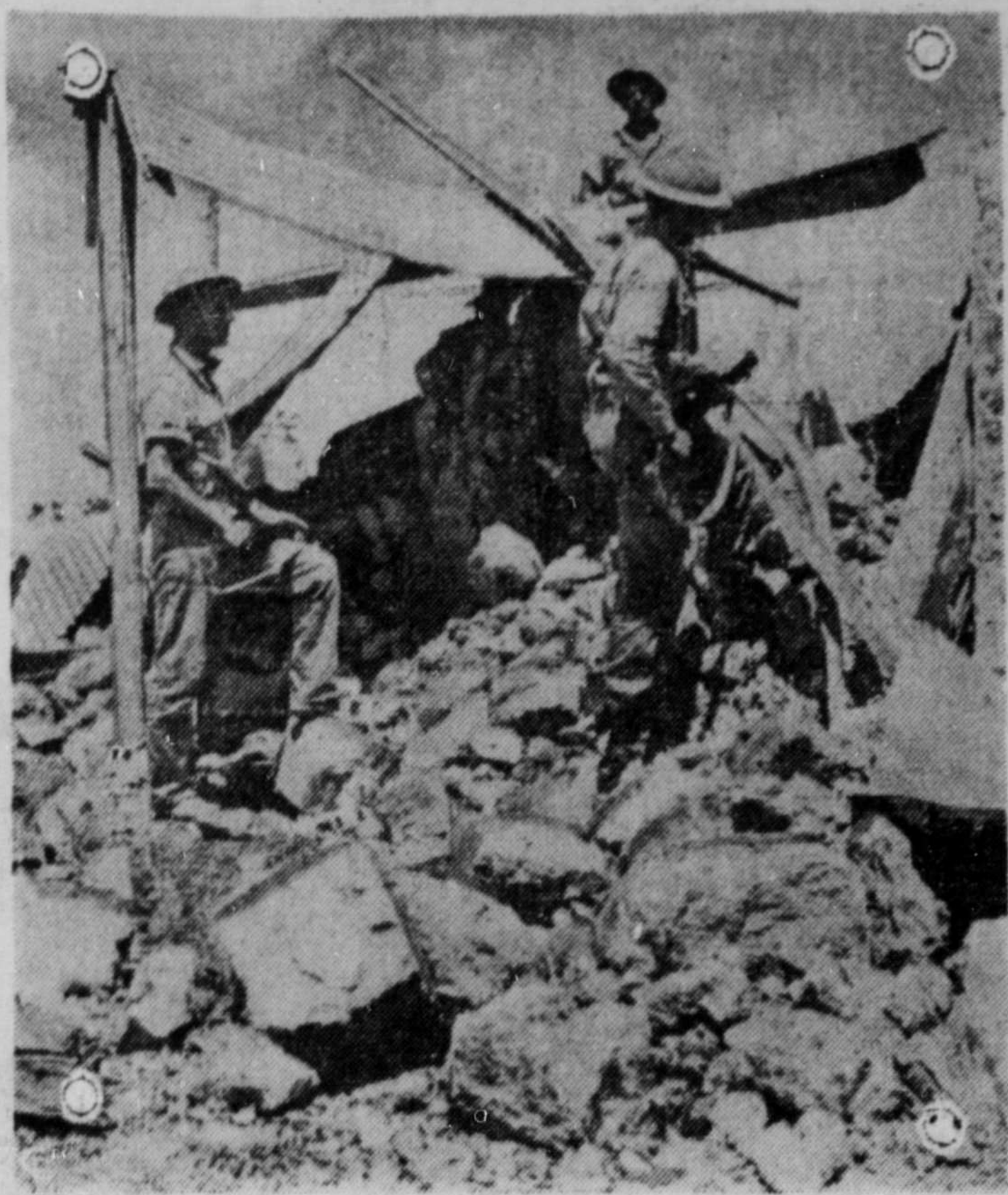
British soldiers are shown occupying the ruined Italian fort which was captured by the British western desert forces after a fierce shelling reduced the fort to rubble.