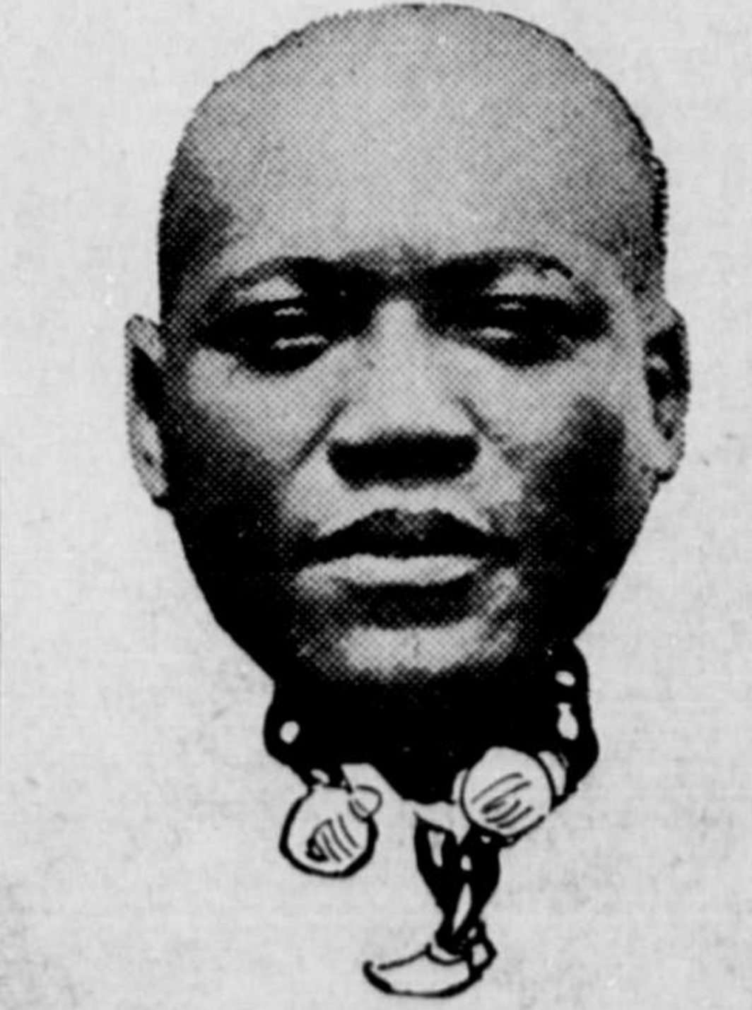
Heavyweight Boxing Champion