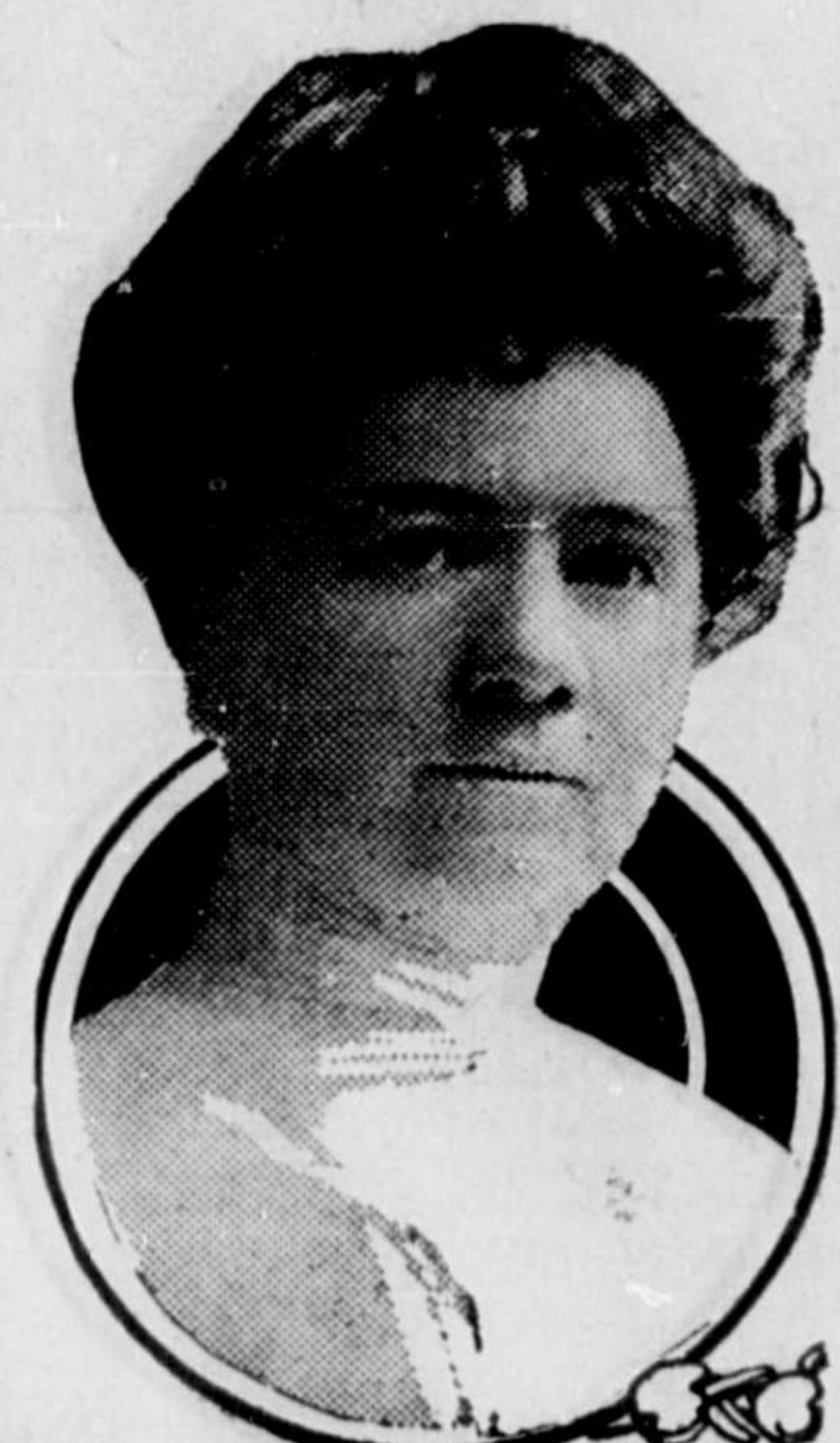
MISS MARTHA BERRY

Miss Martha Berry of Possum Trot, Ga., who some nine years ago started in a very crude way a school for the "highlanders" of the south, started her work with a little ragged group of children, telling them stories of a Sunday, and thus she became known as the "Sunday Lady of Possum Trot." With a leaky shack, a squeaky melodeon and one hymn book she did the pio-