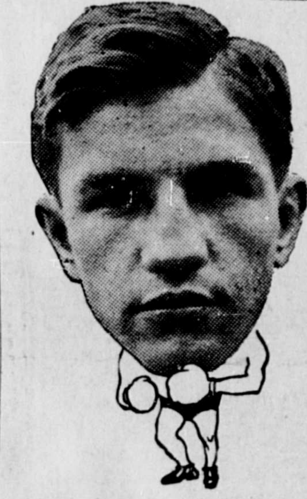
Lightweight Boxing Champion