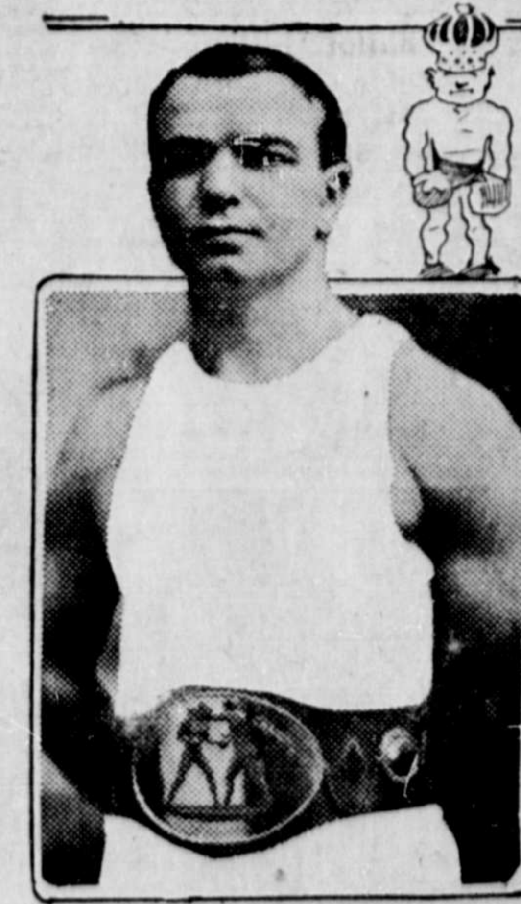
Champion Lightweight of Canada