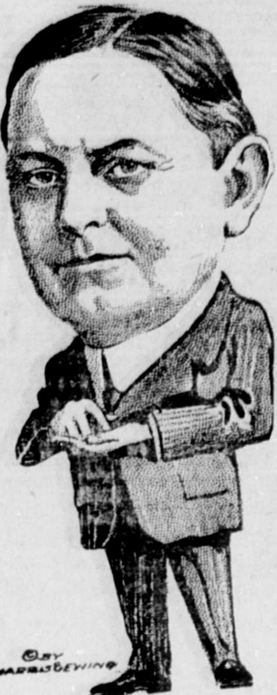
OSCAR W. UNDERWOOD

Oscar W. Underwood, the Democratic leader in the House at Washington, says that he is utterly against the initiative and referendum. He says: "I believe that it is subversive of the very form of our government. It is the negation of representative government. It is wholly reactionary and not progressive. I believe, however, that the initiative, referendum and recall should not be placed in the na-