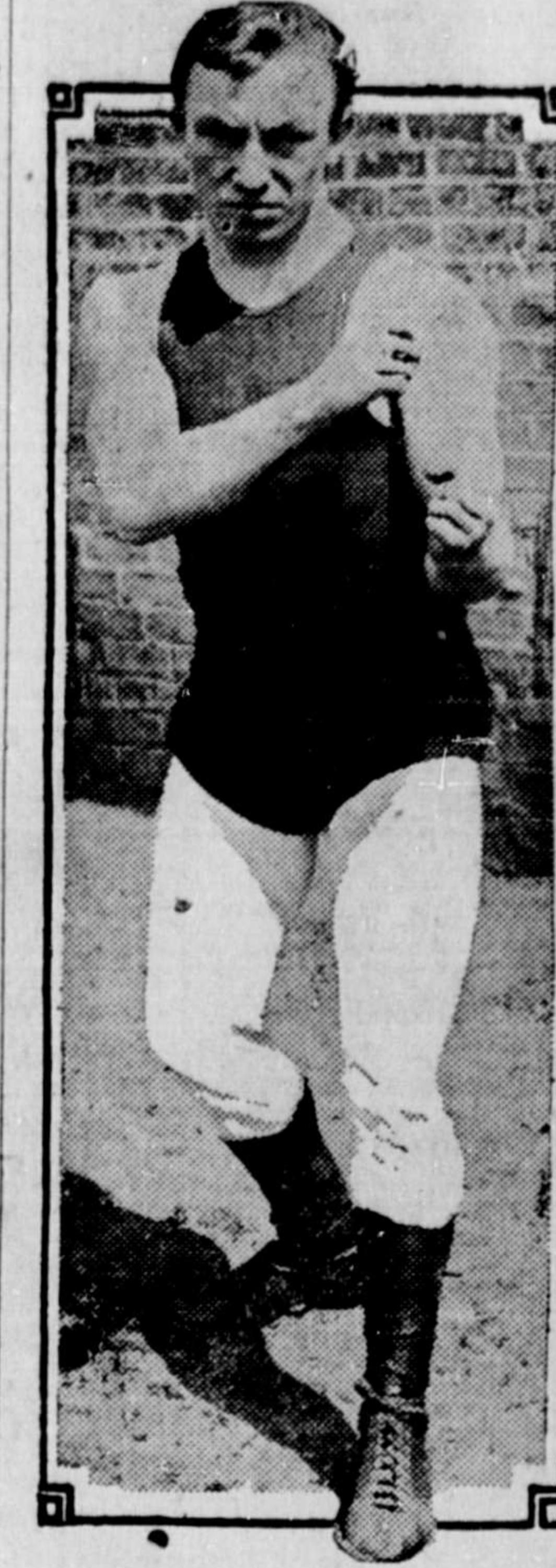
Bantam Boxing Champion