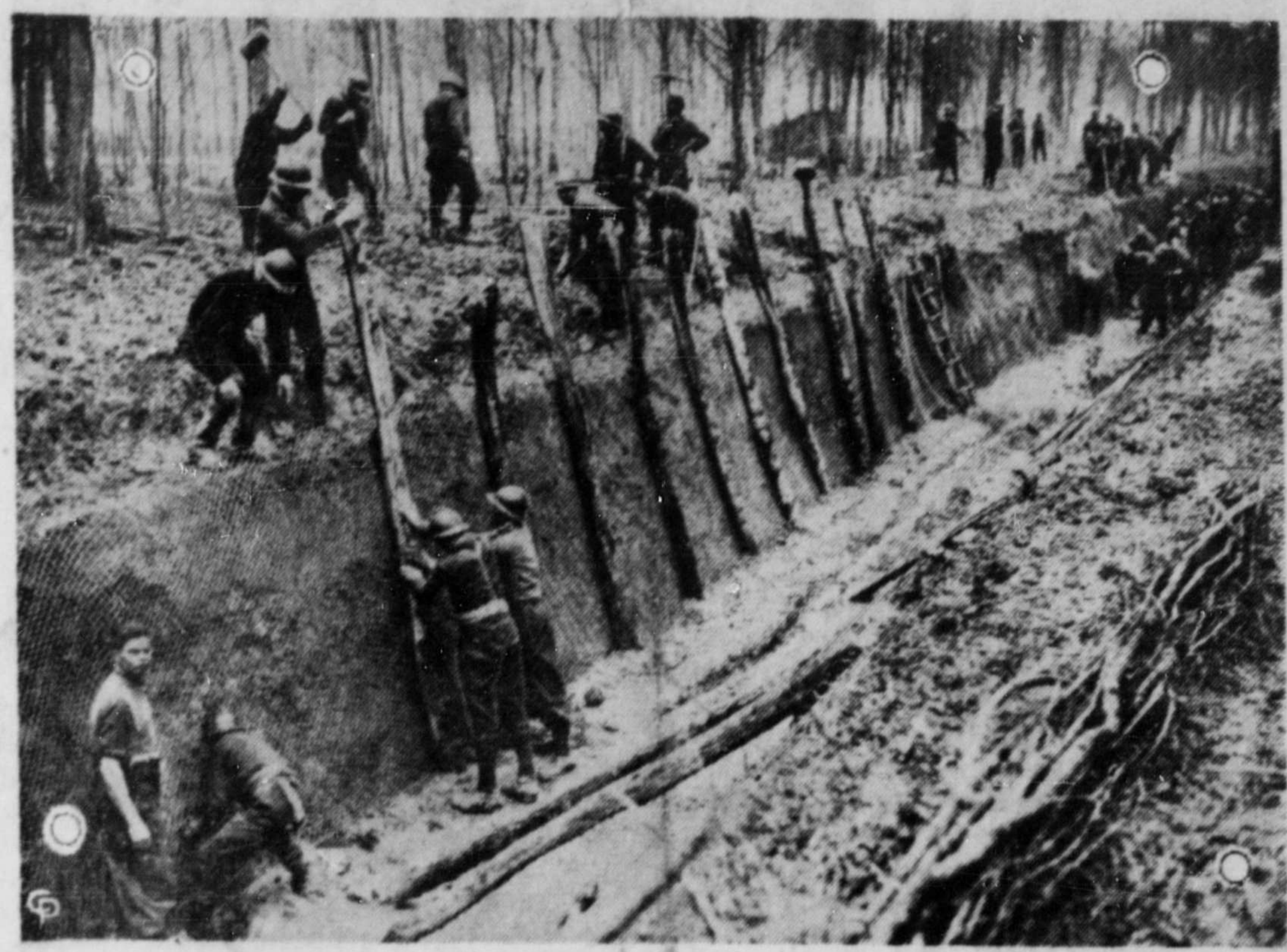
French engineers are shown at work on one of the gigantic ditches they have constructed along the Western Front as a barricade against German tanks. The ditches are dug with steep walls that give a tank a drop of about 15 feet and make them easy prey for the anti-tank guns.