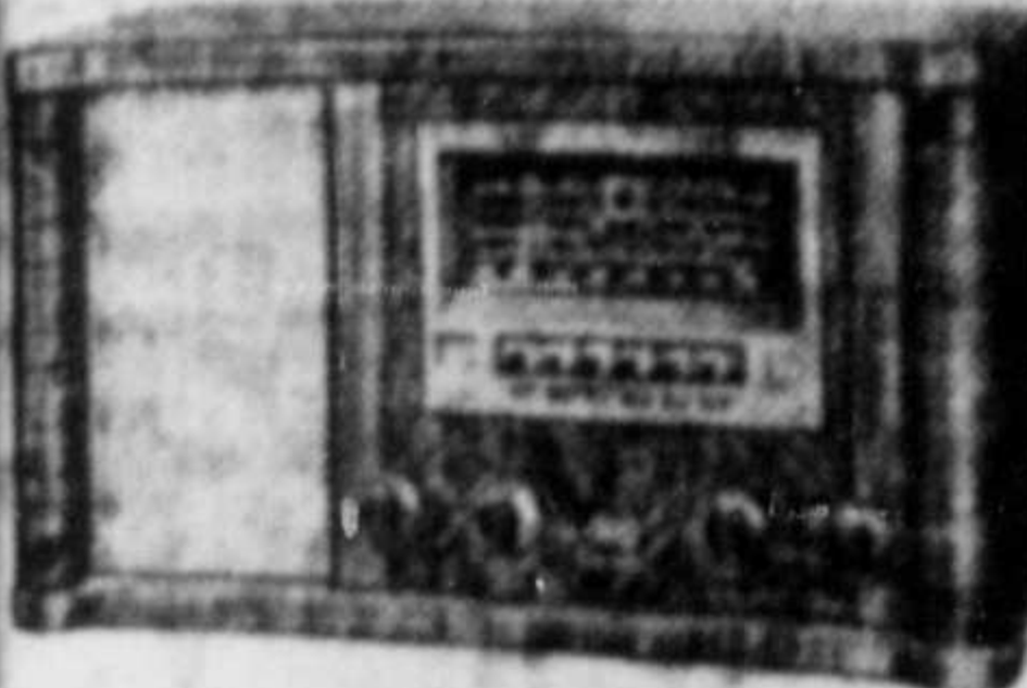
MODEL A-3 —Beautiful in tone outstanding in appearance, this handsome new RCA Victor table model possesses radio's latest features and technical advances. Includes Band Spread (Overseas) Dial to make short wave tuning 50-times-easier. $84.50

BUY NOW... DOWN PAYMENT LOW... TERMS CONVENIENT