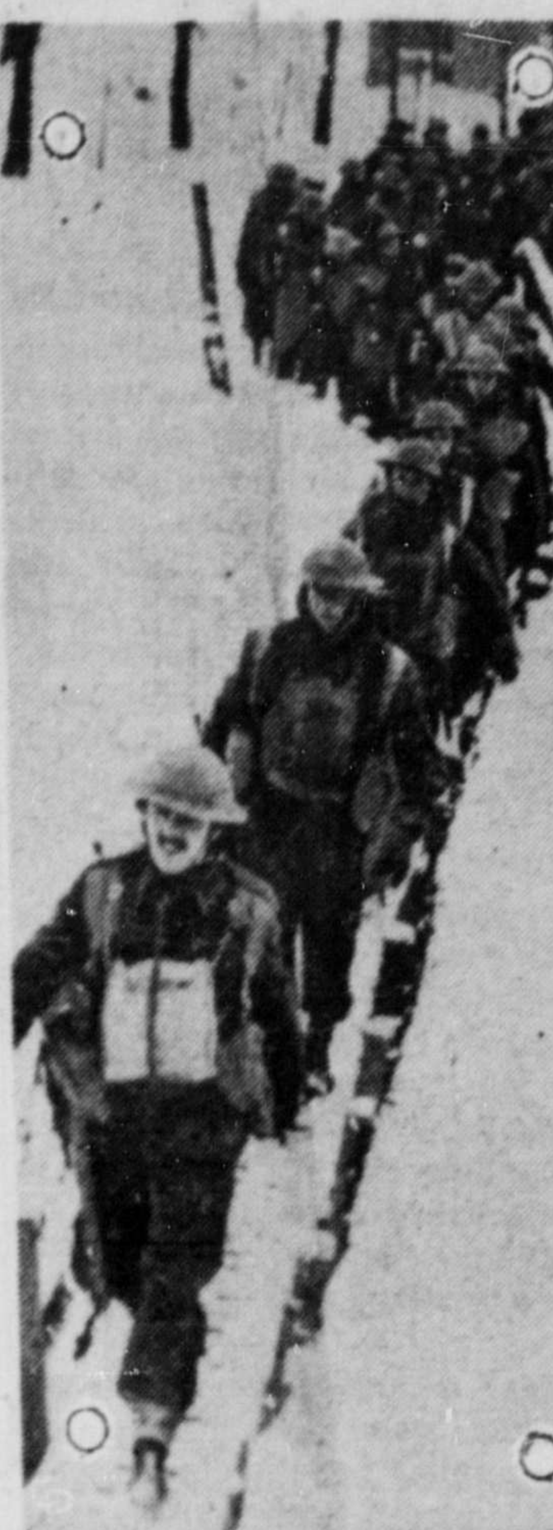
Plodding through a heavy blanket of snow, British Tommies are shown making their way along a communication trench towards positions on the Norwegian front.