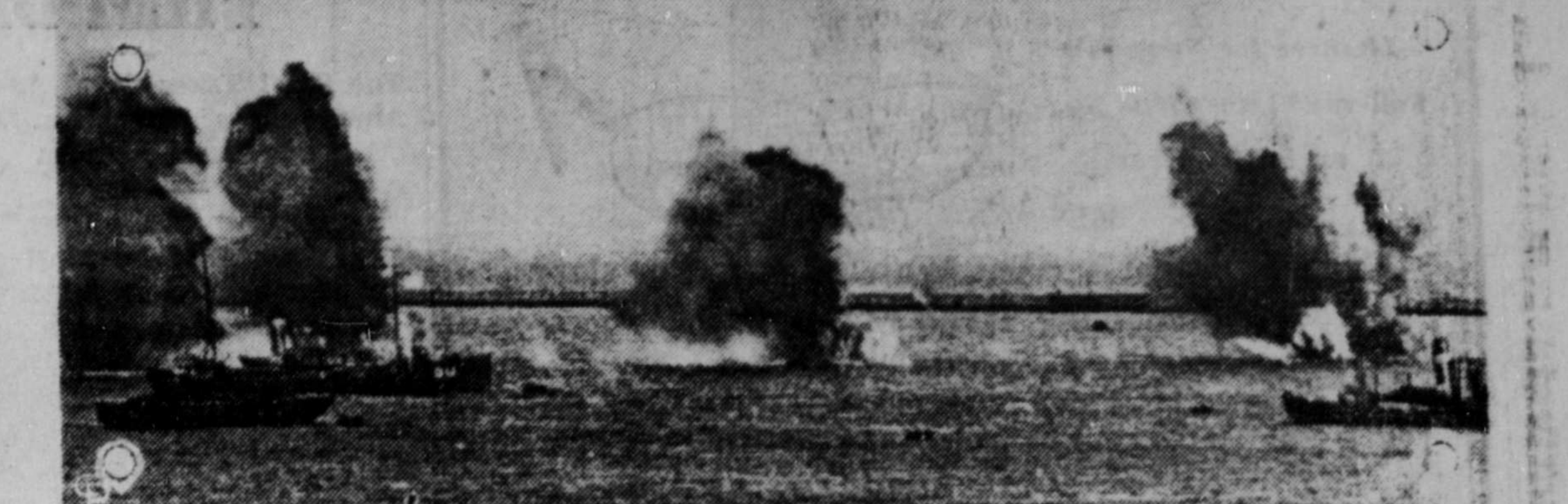
Carrying on in spite of ferocious German assaults, these small British ships used for harbor control have a miraculous escape from destruction as the camera records four misses by German planes roaring overhead on raid duty.