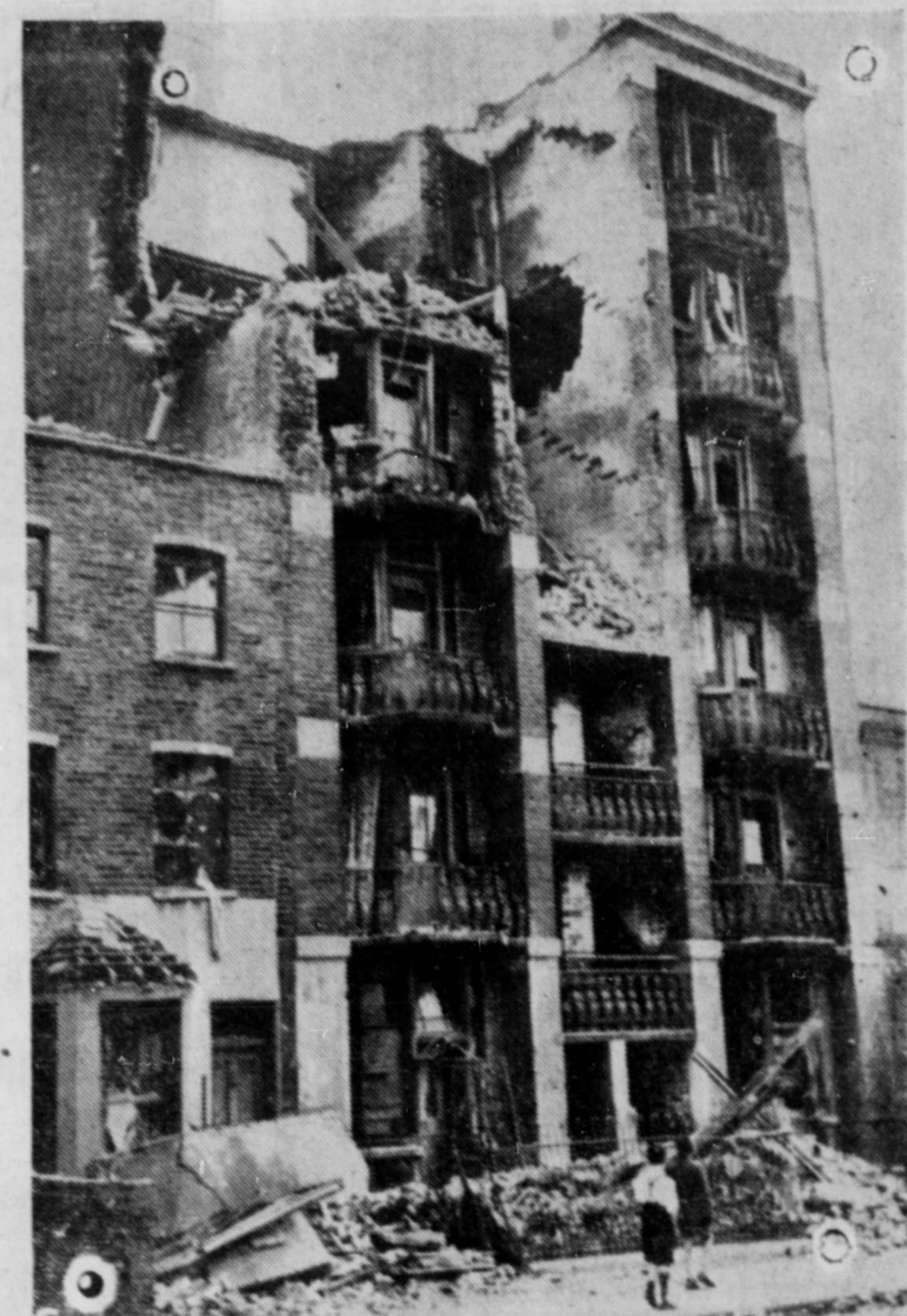
Two London boys look at the debris piled up in front of their ruined home after a German air raid. There are gaping holes in the wall, large sections of the roof are blown away. Children like adults are taking an optimistic attitude toward the orgy of destruction and often prefer to watch the planes with their fateful loads, rather than seek the safety of bomb shelters.