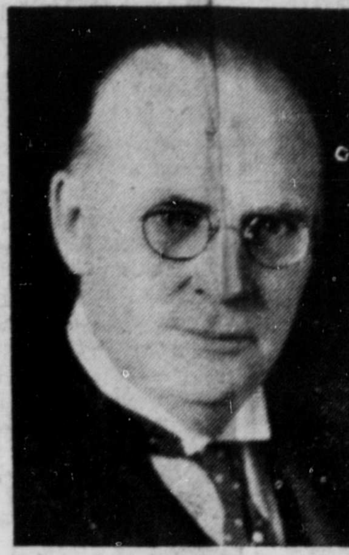
Right Hon. R. B. BENNETT, P.C., K.C. will act as chairman of the bank's Yondon, England, Committee of Directors.