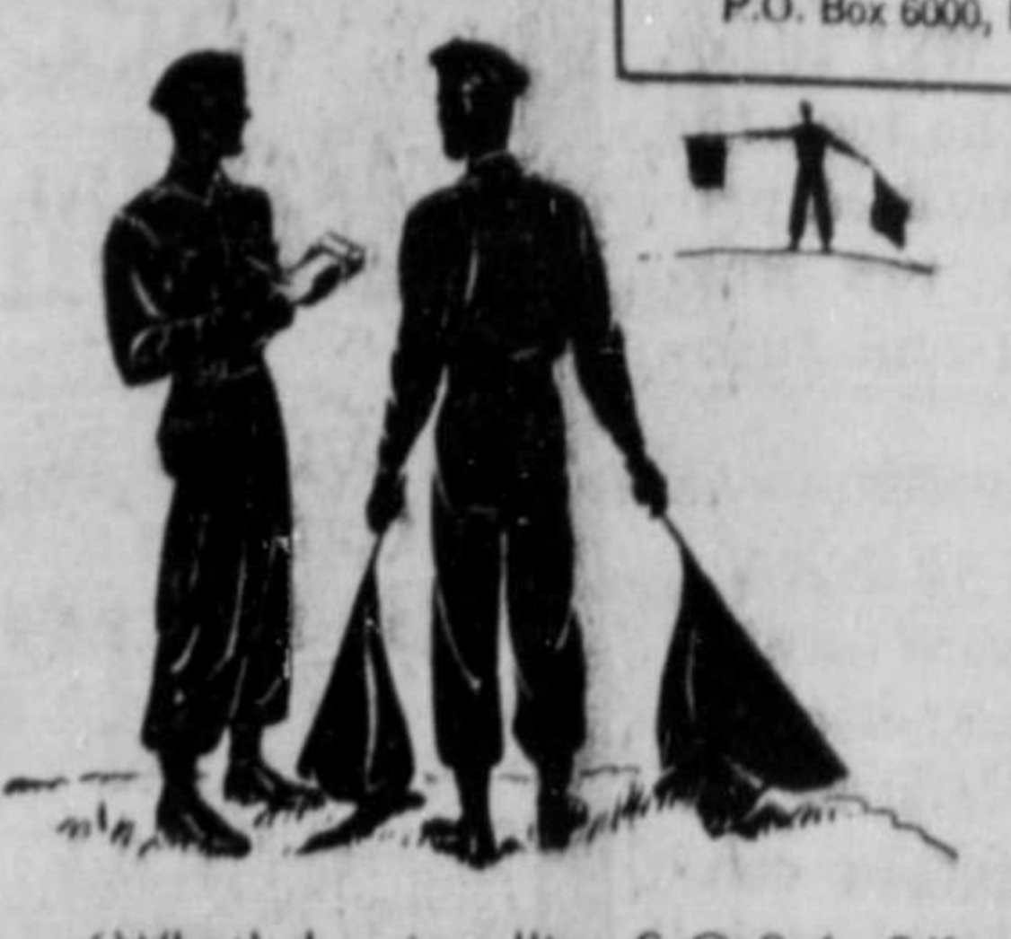
"What's he signalling S.O.S. for?" "He means 'Send out Sweet Caps!'"

$1.00 will send 300 Sweet Caps or 1 lb. Old Virginia pipe tobacco to Canadians serving in United Kingdom Address—"Sweet Caps" P.O. Box 6000, Montreal, Que.