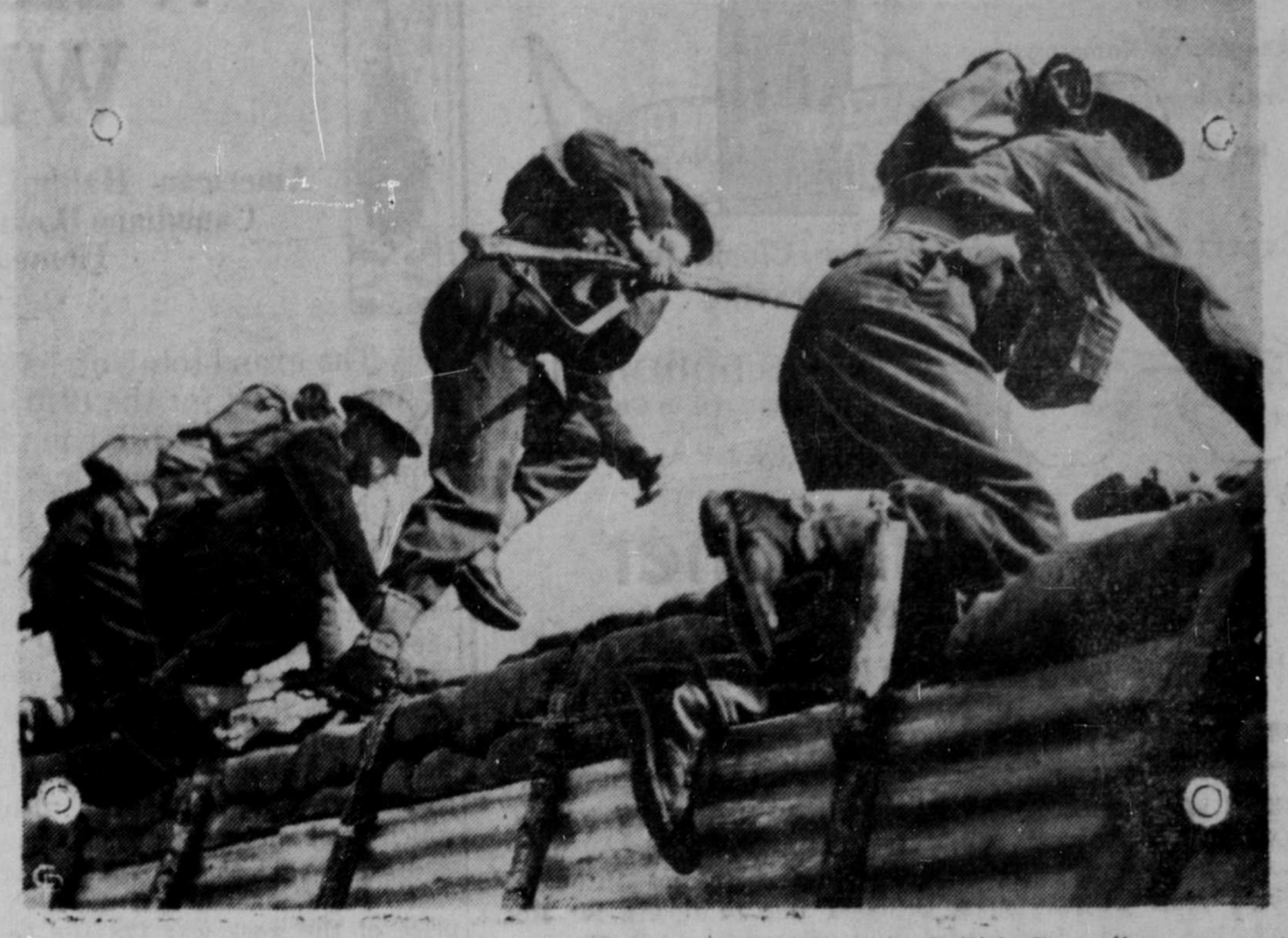
Renowned down through British history in songs and stories, the British Grenadiers are once again taking their place in the battle line and are shown here going over the top during the hardening process that fits them for duty.