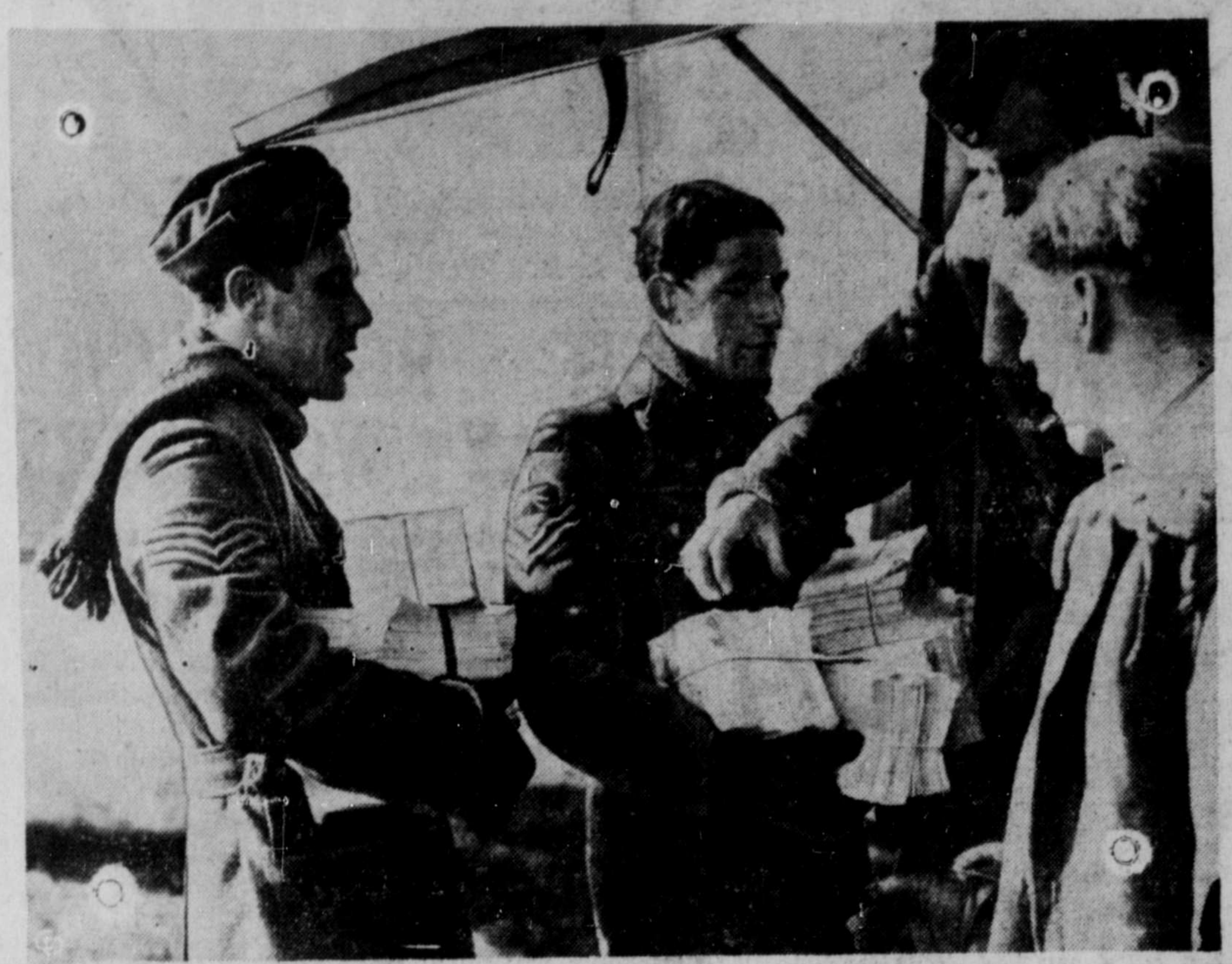
Members of the British Royal Air Force are shown loading up a giant bombing plane with propaganda leaflets just before the start of a reconnaissance flight over Germany. On this occasion the bombers went as far as Vienna, Austria and Prague, Czechoslovakia. The leaflets were broadcast over these capitals of formerly independent nations. All the British planes returned safely to their bases.