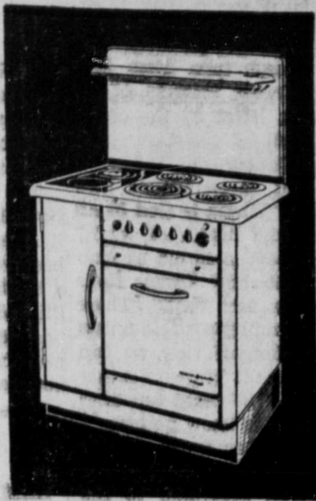
There's heat for winter, if you need it, in an electric range like this. It combines electricity with coal or wood. Easy terms available on all models.

If you're spending hours in a hot kitchen wrestling with an old-fashioned stove: if your fuel bills are high because so much heat is going up the chimney it's time to break away from cooking slavery by installing an Electric Range. Then, you COOK WITH ELECTRICITY at the simple snapping of a switch and every dish holds its full food value.