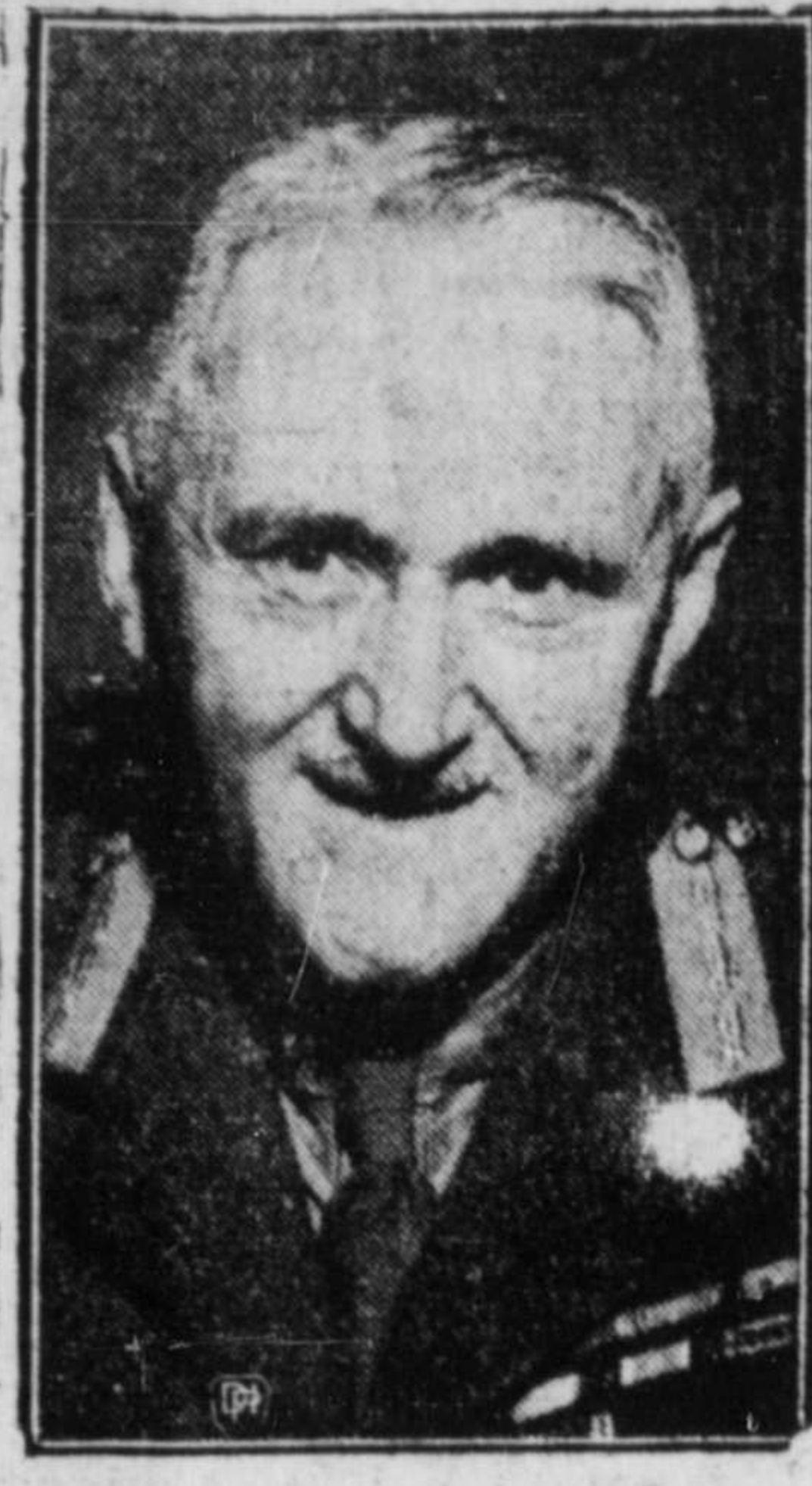
Who commands Canada's Second Division, now overseas.