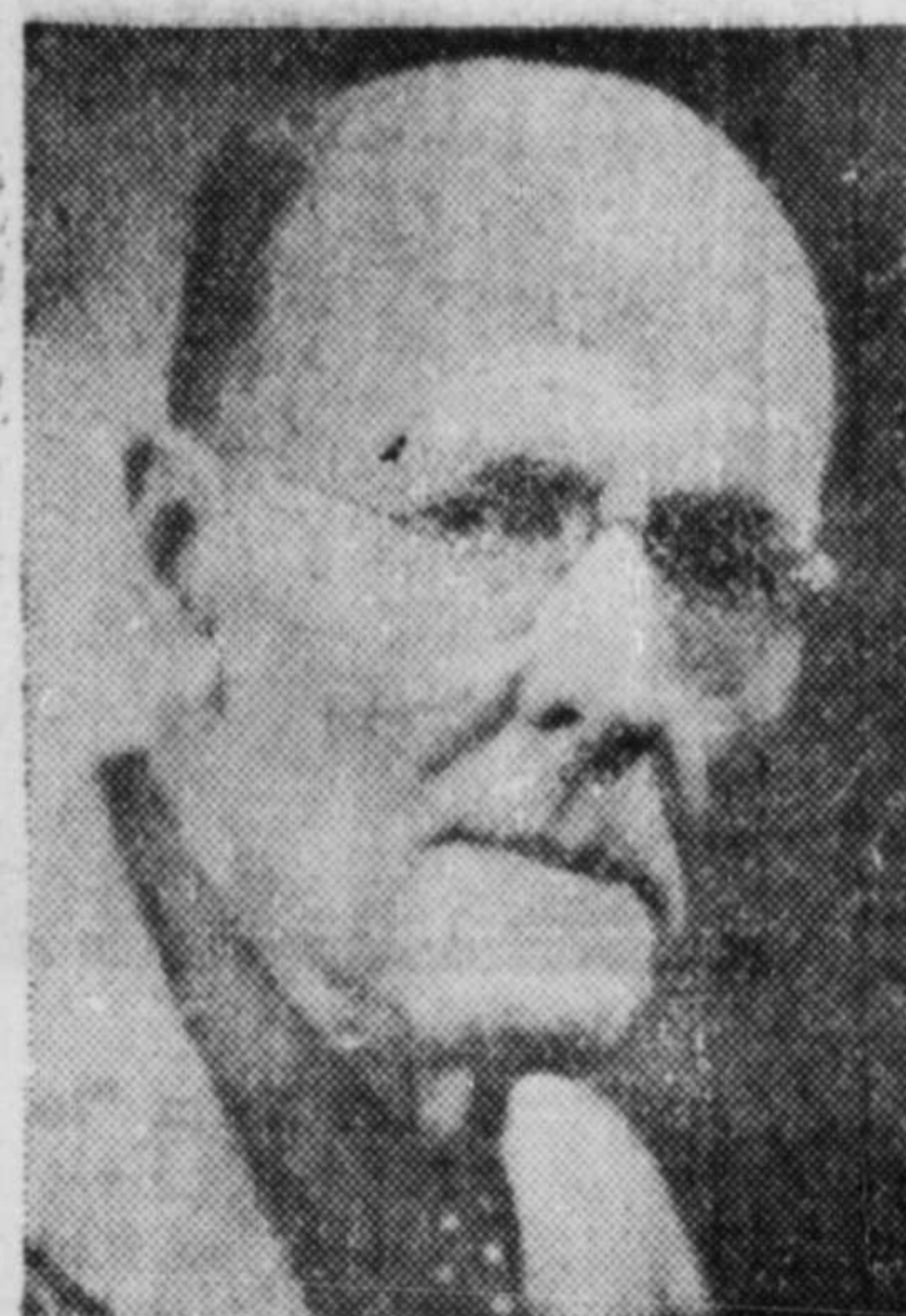
Paul P. Harris