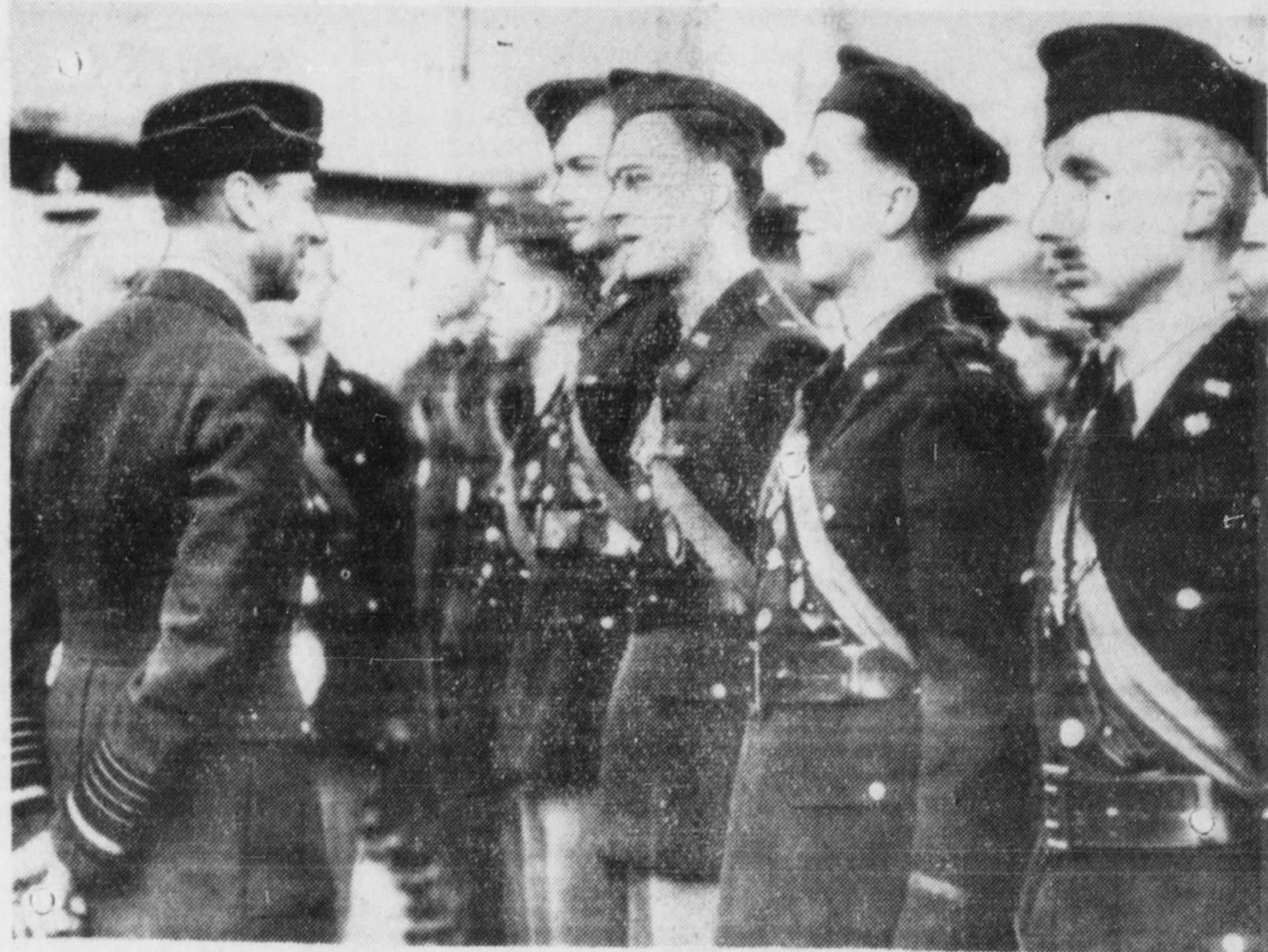
King George is shown chatting with officers of the United States army stationed in England as observers with the Royal Air Force during a recent inspection.

KING INSPECTS U.S. OBSERVERS STATIONED WITH R.A.F.