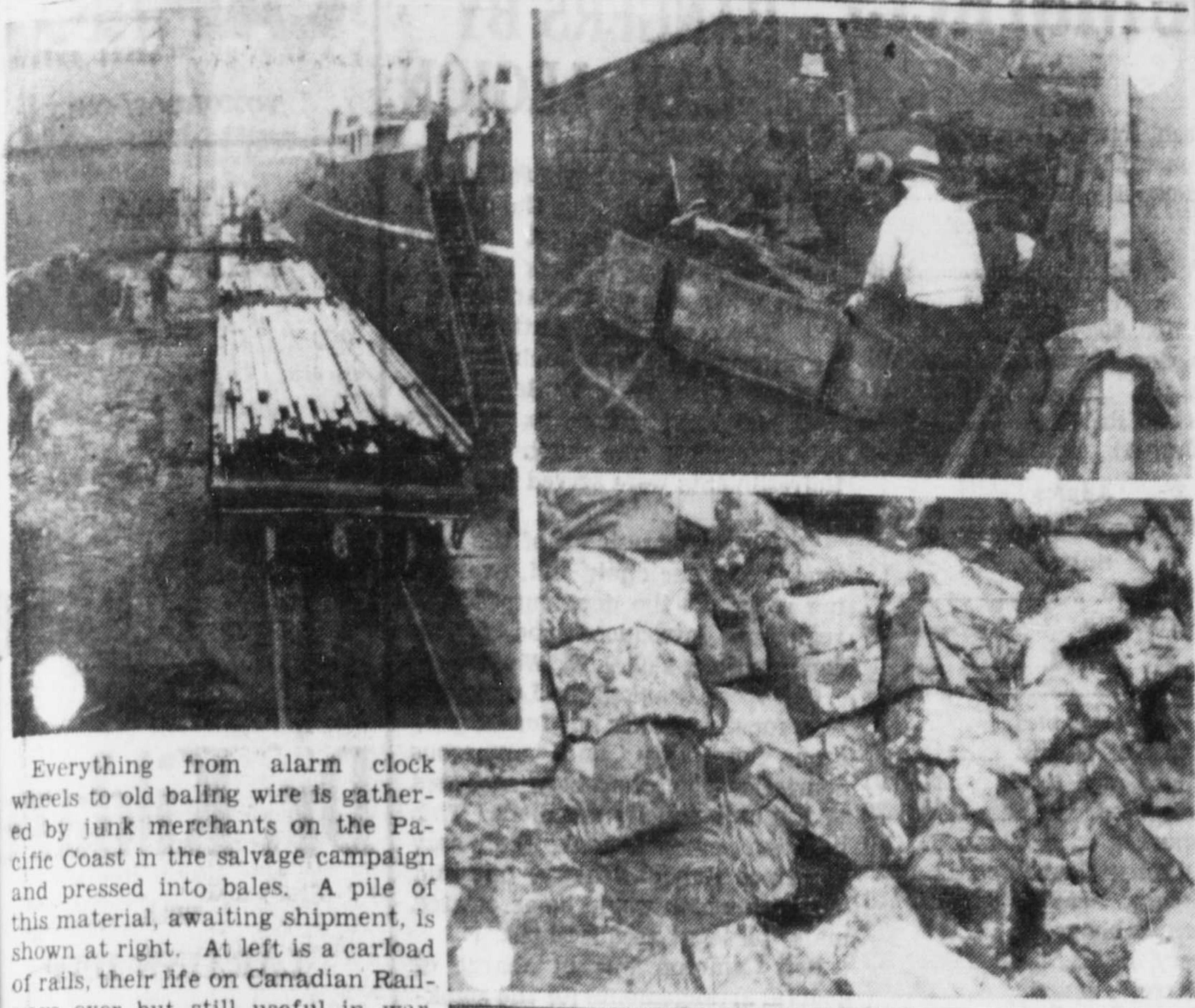
Everything from alarm clock wheels to old baling wire is gathered by junk merchants on the Pacific Coast in the salvage campaign and pressed into bales. A pile of this material, awaiting shipment, is shown at right. At left is a carload of rails, their life on Canadian Railways over but still useful in war. Much of the junk must be handled piecemeal as that at upper right, a slow and costly business.