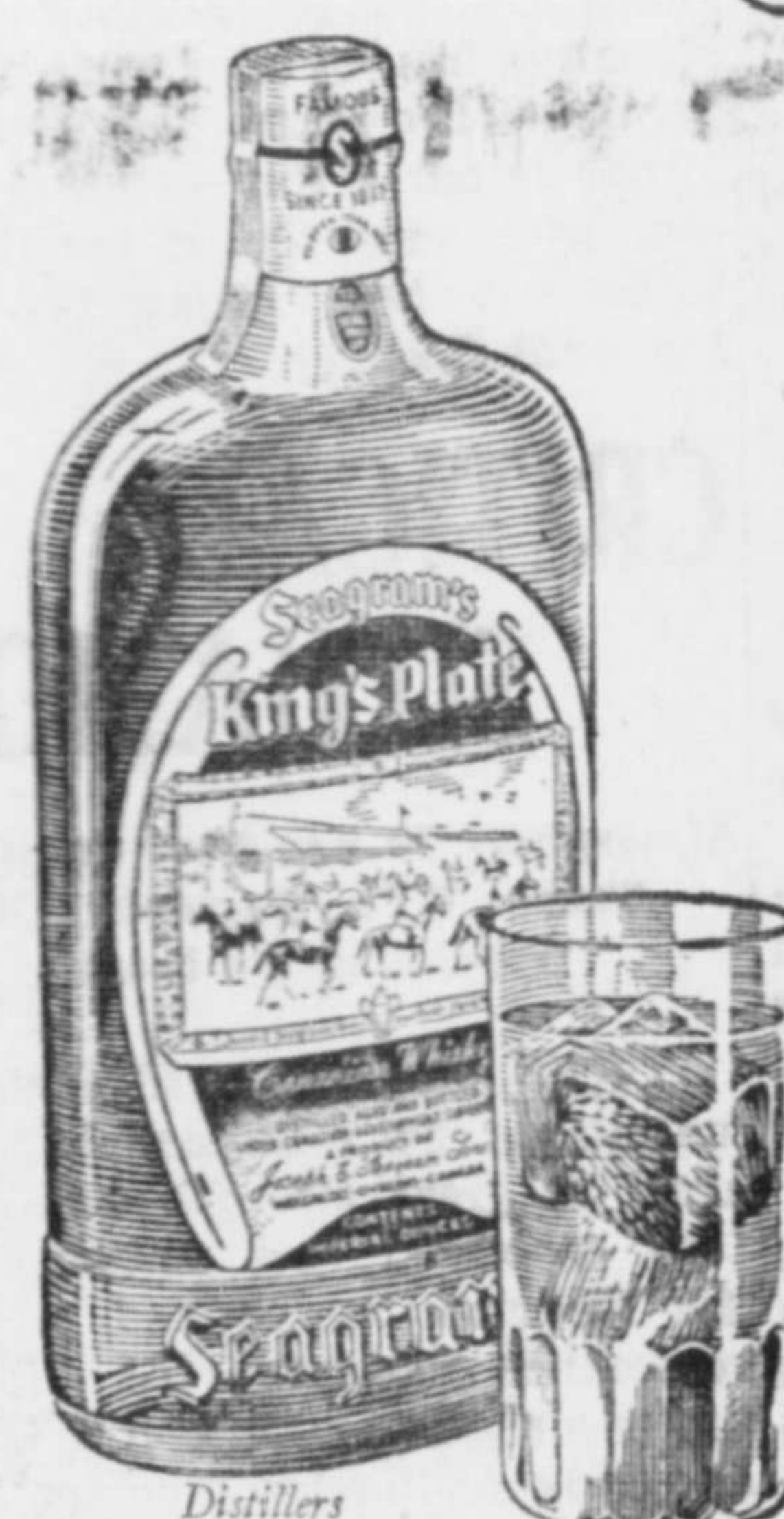
Distillers of Fine Whiskies since 1857 JOS. E. SEAGRAM & SONS LIMITED WATERLOO, ONTARIO

Every drop of Seagram's is distilled, aged and blended to meet this one all-searching test. Seagram Whiskies demand nothing more than plain or sparkling water to give you a truly delightful drink.