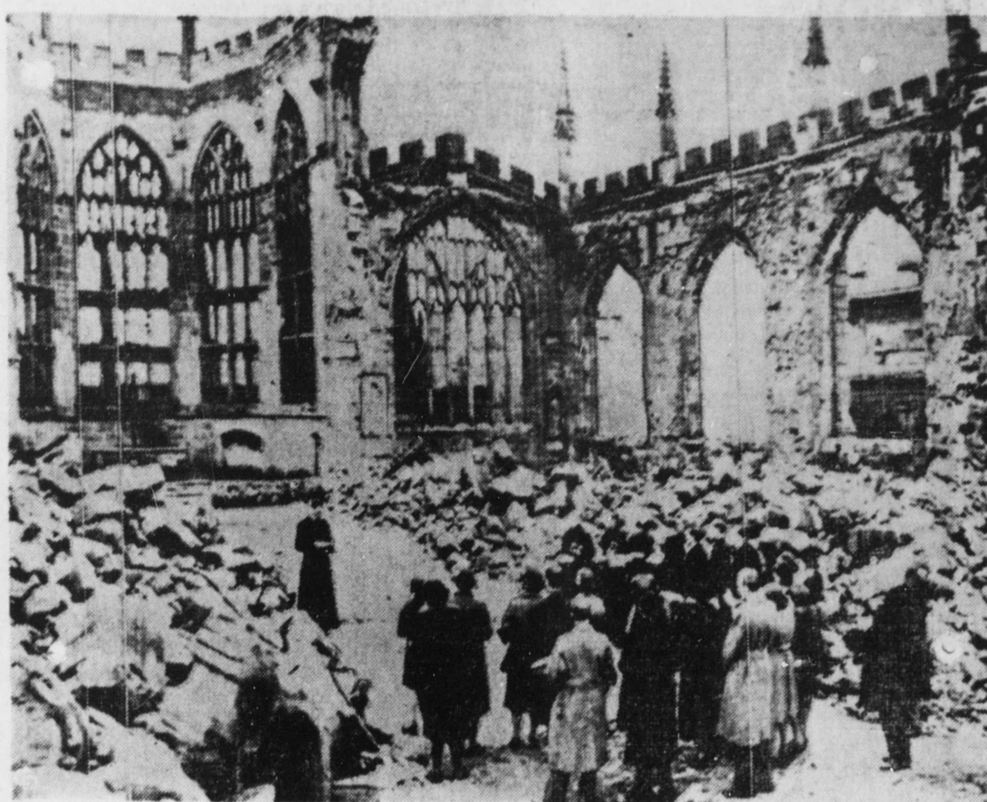
On Good Friday evening, in a drizzling rain, a small group of men and women, including policemen and firemen who had not slept for three days, gathered in the ruins of Coventry Cathedral for prayer. It was after a visitation by German bombers. A cross of charred wood stood over the improvised altar in the roofless building. The archdeacon told the bareheaded congregation: "It matters not when we die, only how we die." Coventry, a few months ago, was the object of one of the most merciless air raids of the war.