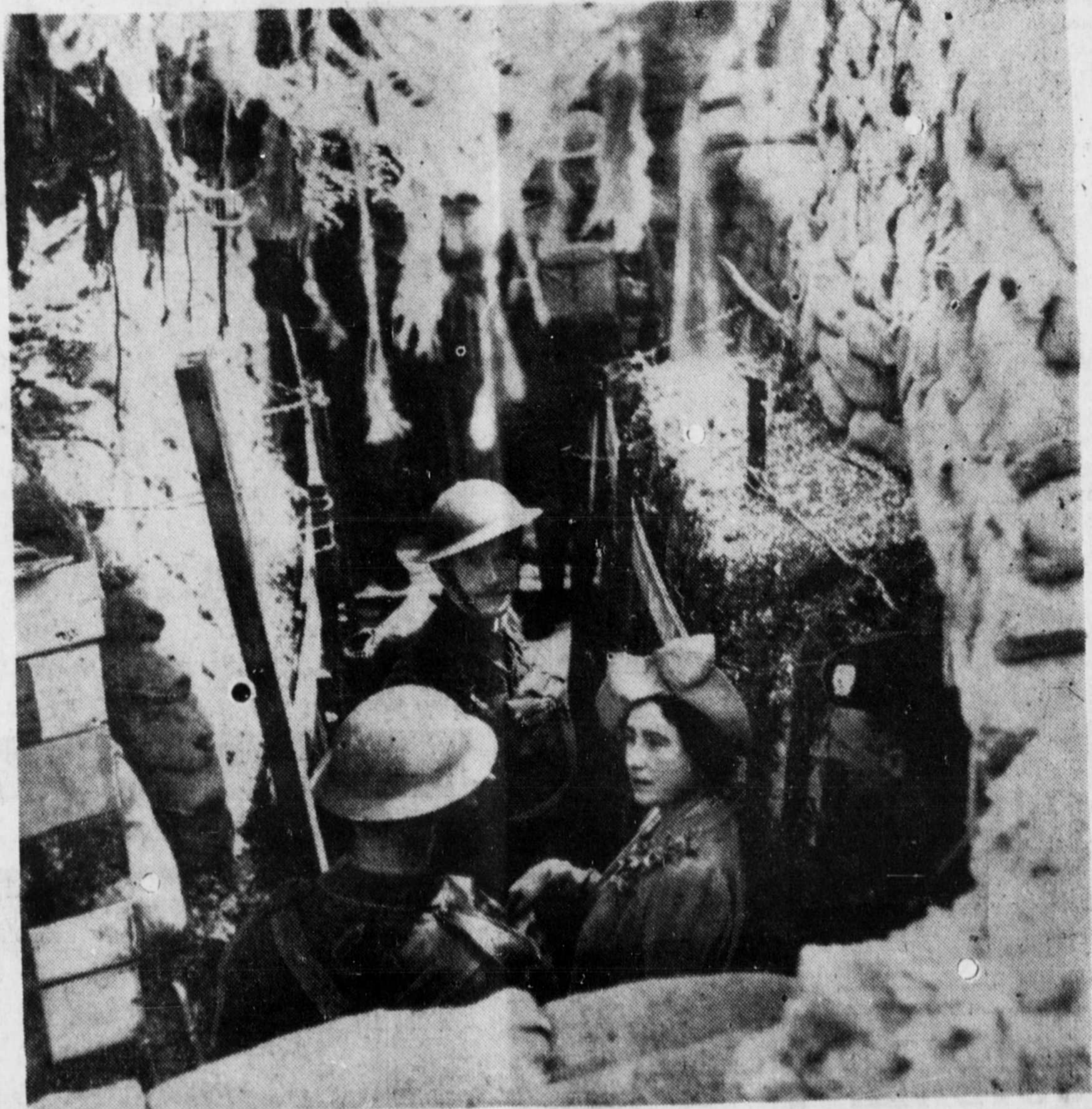
Queen Elizabeth, who is honorary colonel of the London Scottish Regiment, is shown in a trench during her recent visit to that part of the defence lines held by the regiment. Part of the camouflage net that hides the trench from the air may be seen at top of the picture.