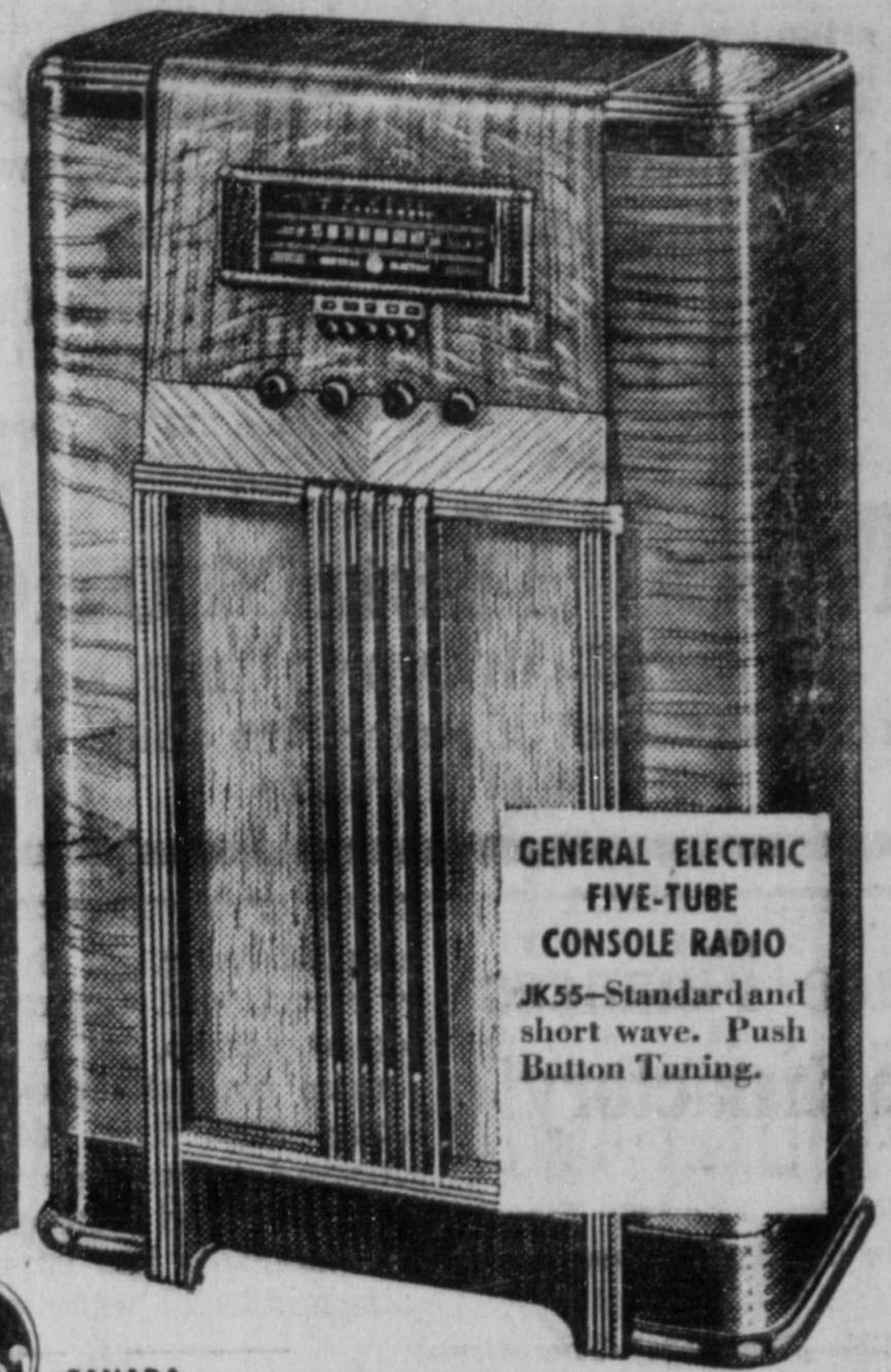
GENERAL ELECTRIC FIVE-TUBE CONSOLE RADIO JK55—Standard and short wave. Push Button Tuning.

NO GREATER VALUE IN BEAUTY..PERFORMANCE and PRICE Domestic and overseas broadcasts come in with new clarity and lovelier tone—easier, faster, better, on the new 1941 G-E Golden Tone Radios. With their improved feather touch, tuning and their modern styling, G-E Radios reach a new peak in convenience and beauty. There's a model for every room. Visit your dealer's. Surprise your eyes—treat your ears to the finest radio can offer. Convenient budget terms.