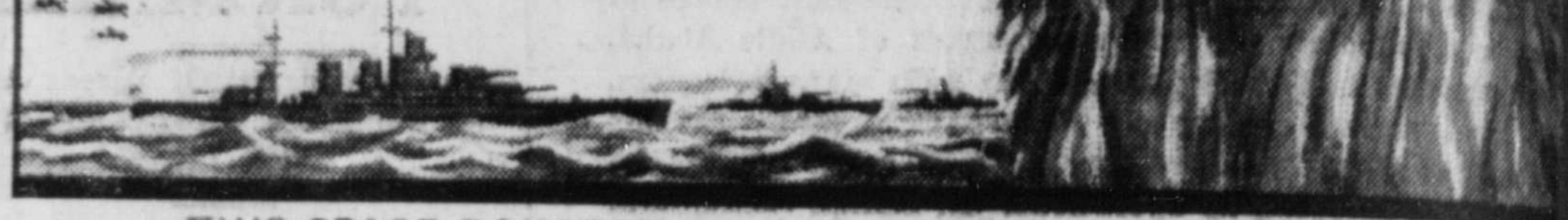
THIS SPACE DONATED BY FRY-CADBURY LTD. MONTREAL