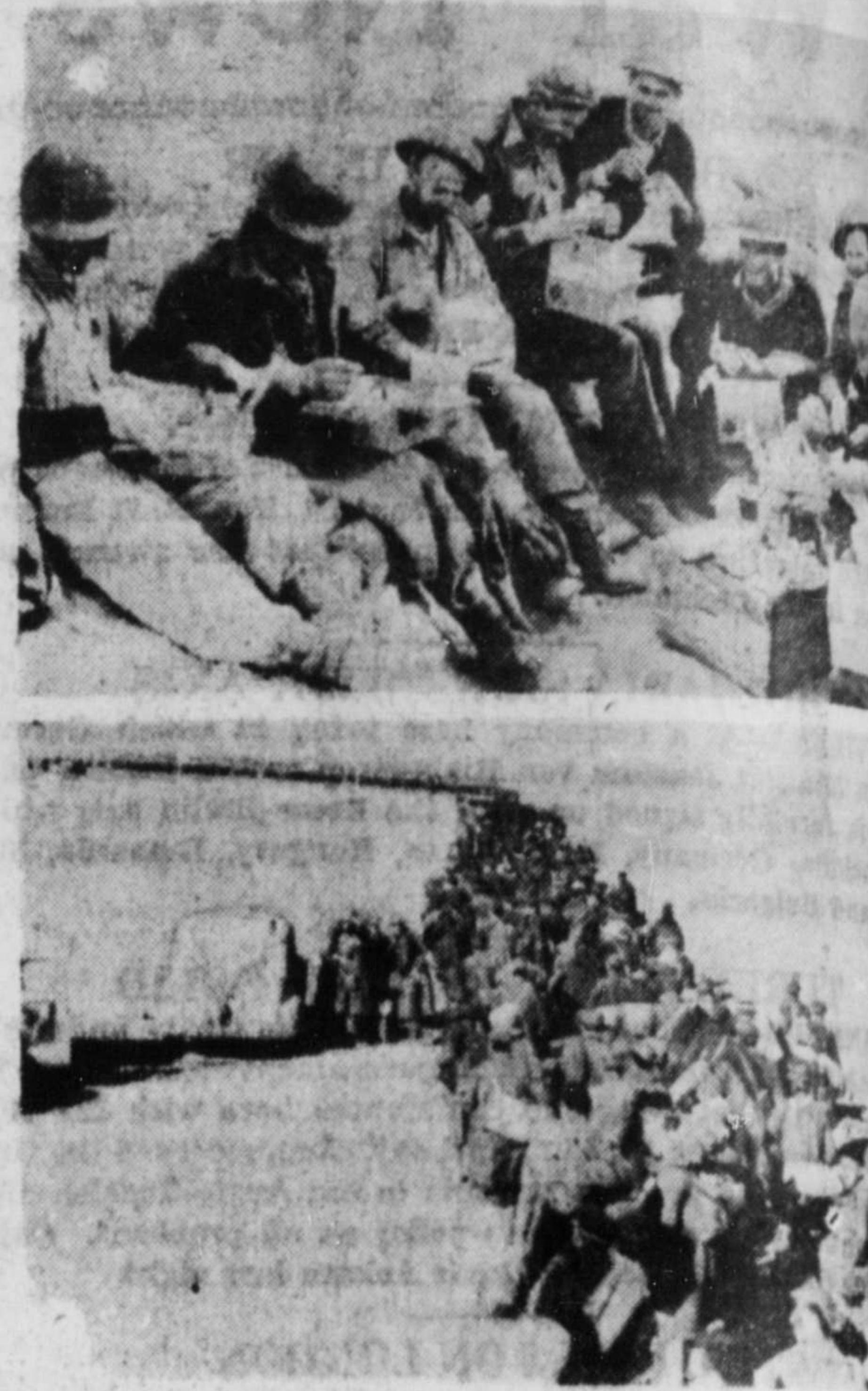
A picnic in the desert near Bardia, Australian soldiers of Imperial Army of the Nile are shown enjoying themselves at home after their successful assault on the Italian army in Libya. Below, a long, long trail of Italian prisoners march across the desert in the general direction of the Suez Canal objective of the Italian drive that went into reverse.