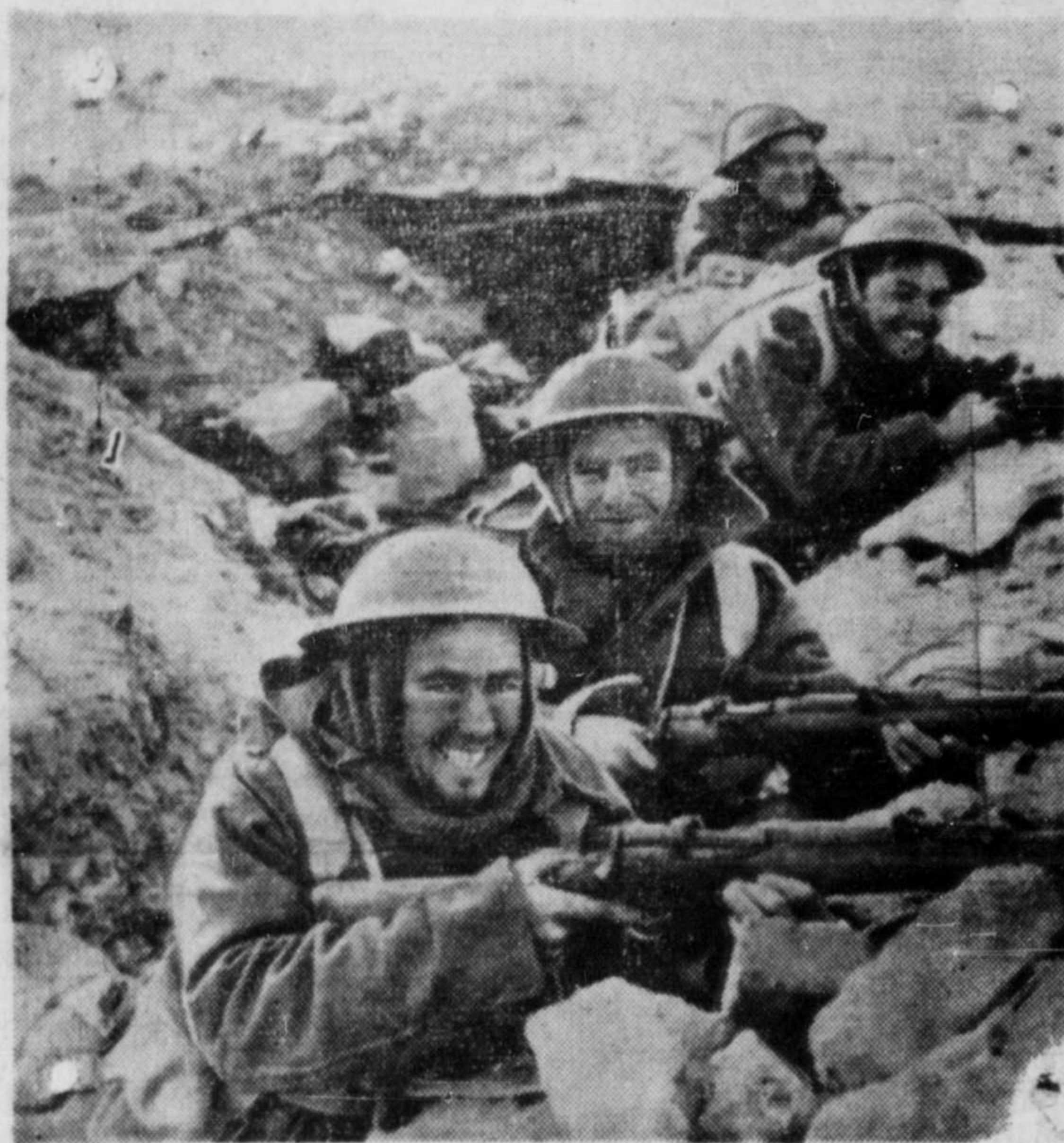
Two pictures illustrate the terrain through which British forces are fighting their way as they drive the Italians before them in Libya, North Africa. At the top, infantrymen behind a rock and sand barricade, man rifles and machine-guns as they blast down the opposition. Below, the Tommies take time out to grin cheerfully for the camera from their rocky trenches. It must be cold, even in the desert. Note the heavy mufflers, or maybe they are protection from the sand.