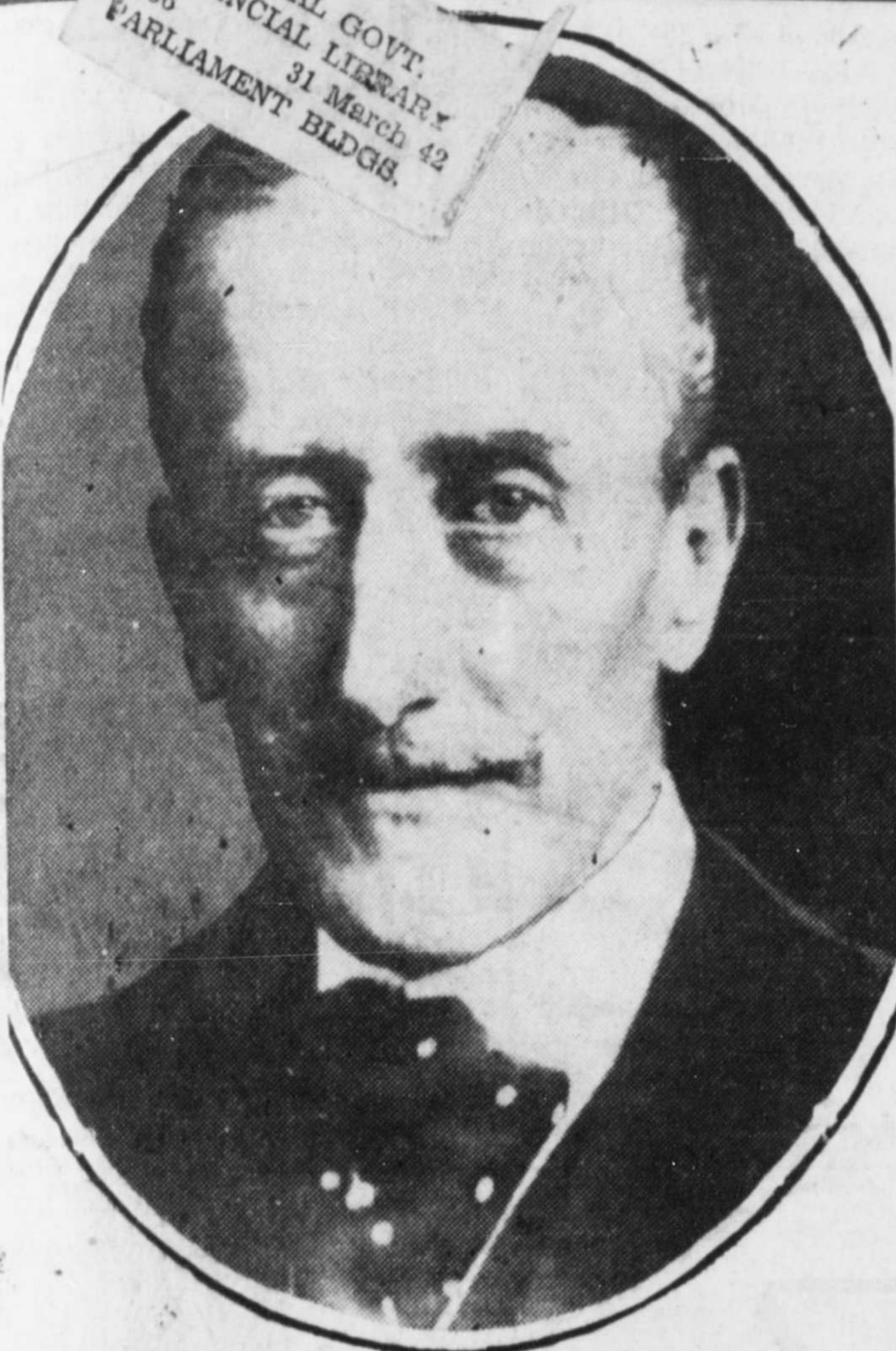
HAD VARIED AND BRILLIANT CAREER

MARQUESS OF WILLINGDON FORMER GOVERNOR GENERAL CANADA, PASSES AWAY