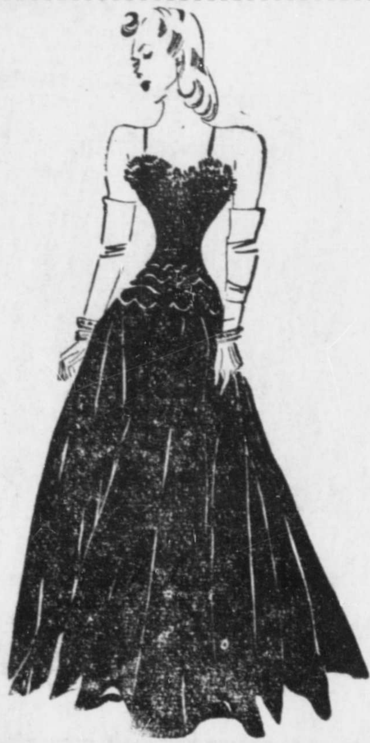
FIGURE FLATTERING . . . BUDGET PRICED

Our new Winter Formals and Dinner Frocks are grand examples of the "Who's She" fashions you want for important evenings. Fluttering chiffons, nets, shadowy marquisettes give you a wide selection of all that's new and smart.