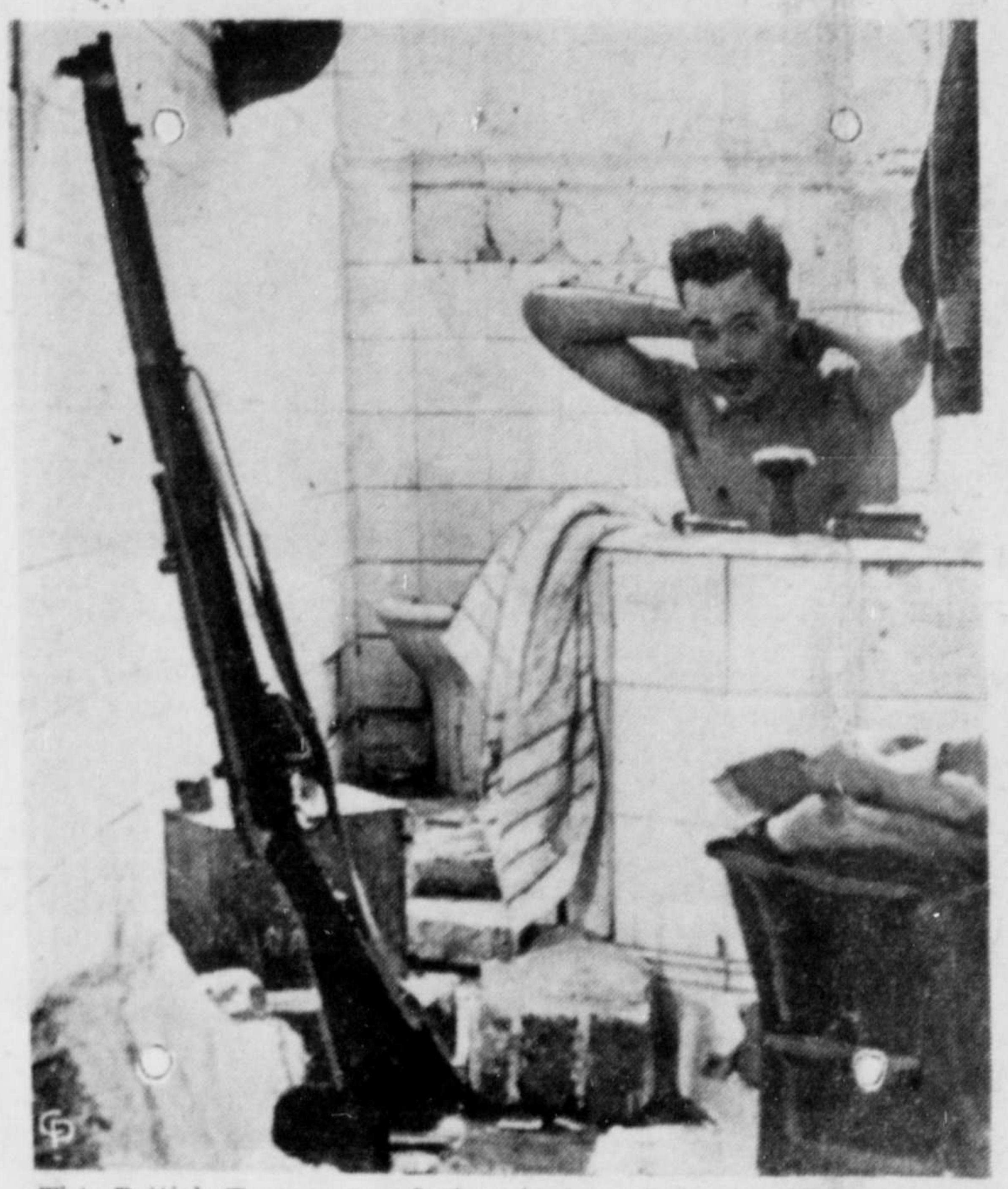
This British Tommy was fortunate enough to stumble on a rusted bathroom during operations in Libya and he immediately decided to boost his morale by taking a bath. He kept his rifle within arm's reach, however.